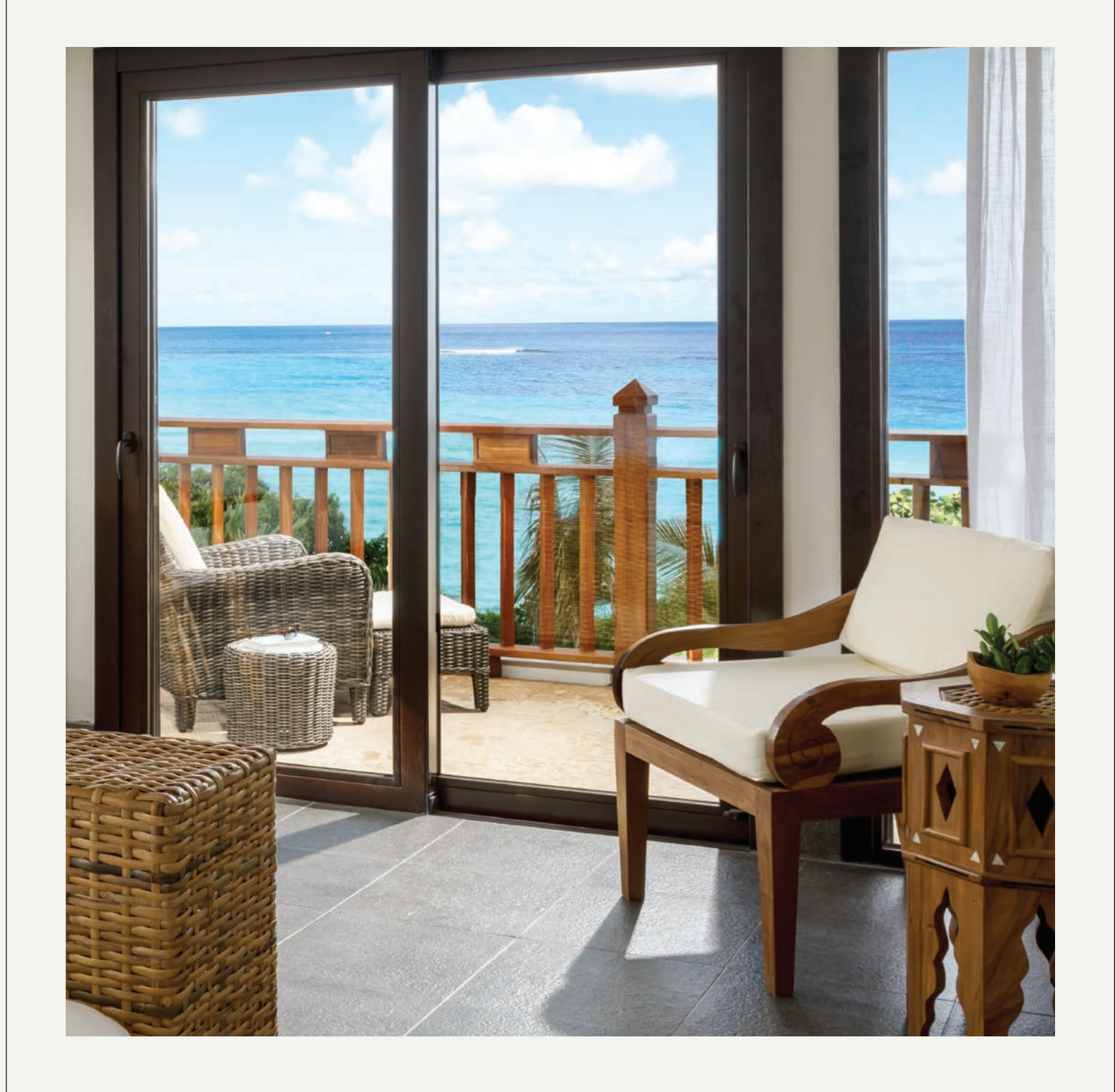
PREMIUM OCEAN VIEW