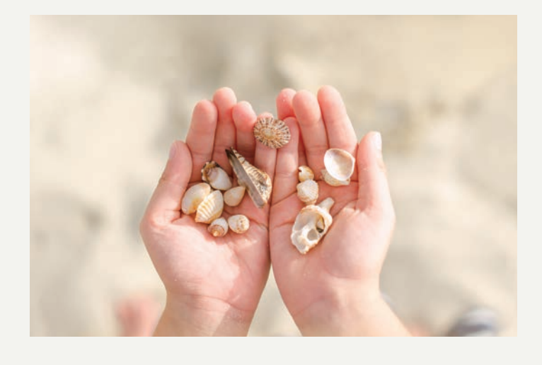
WELCOME TO ZEMI BEACH HOUSE HOTEL & SPA