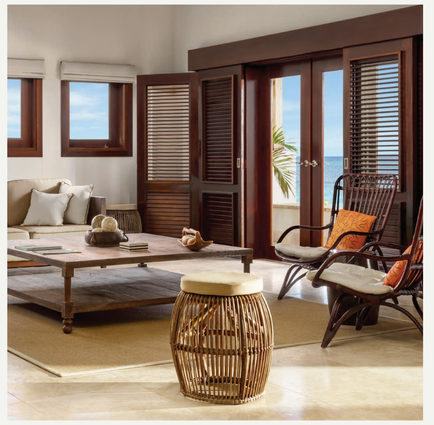
BEACH FRONT THREE BEDROOM RESIDENCE