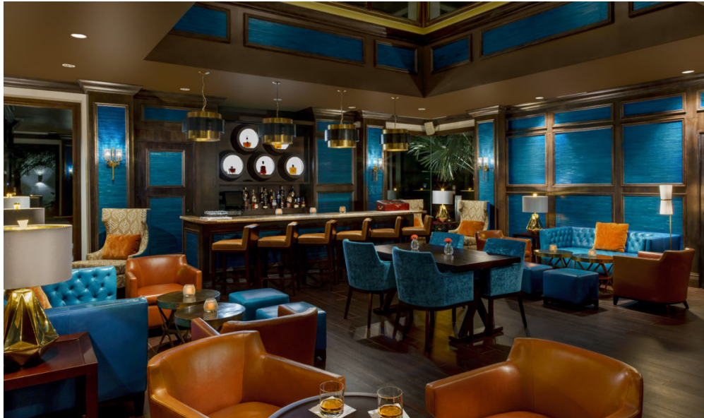
The spectacular Rhum Room