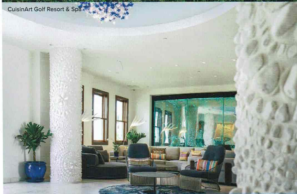
CuisinArt Golf Resort & Spa