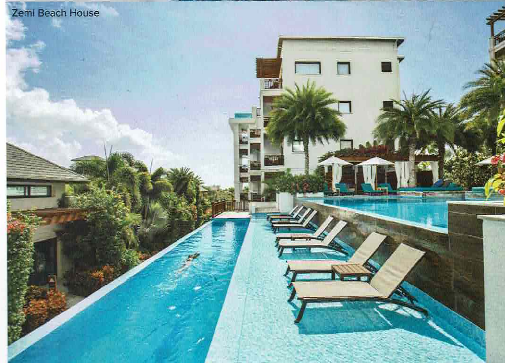
Zemi Beach House