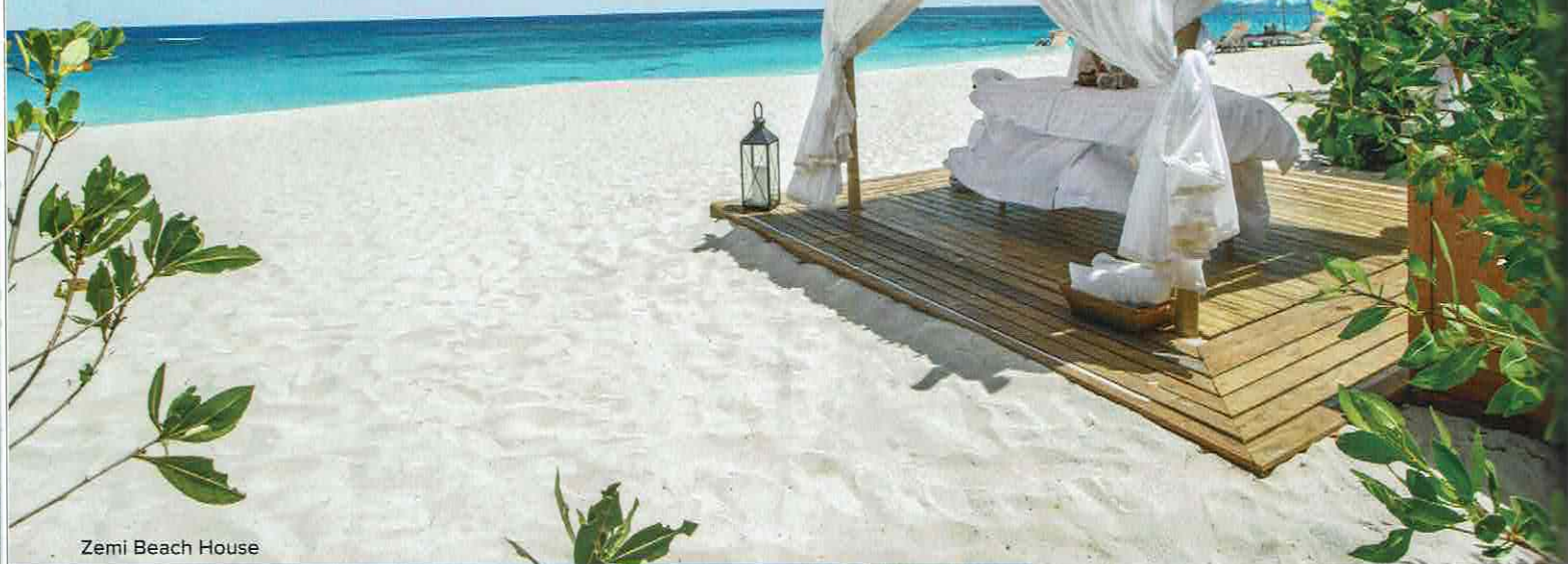
Zemi Beach House