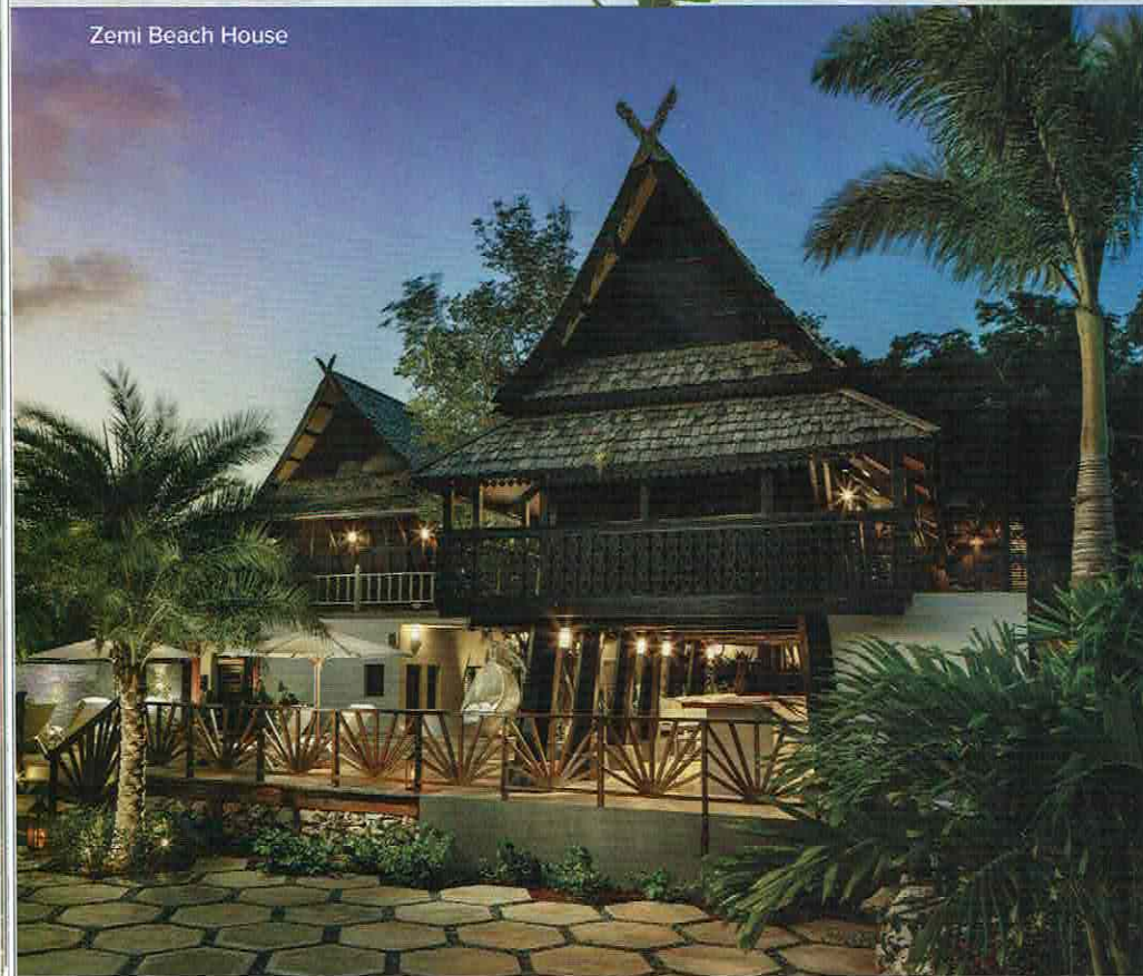
Zemi Beach House