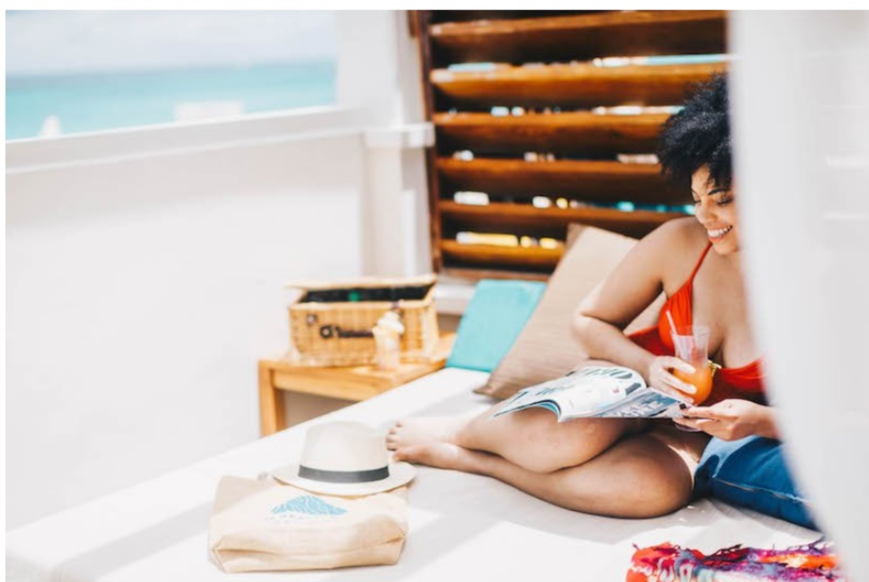
The best places for some pool side pampering

by American Spa Staff | Aug 8, 2018 5:24pm