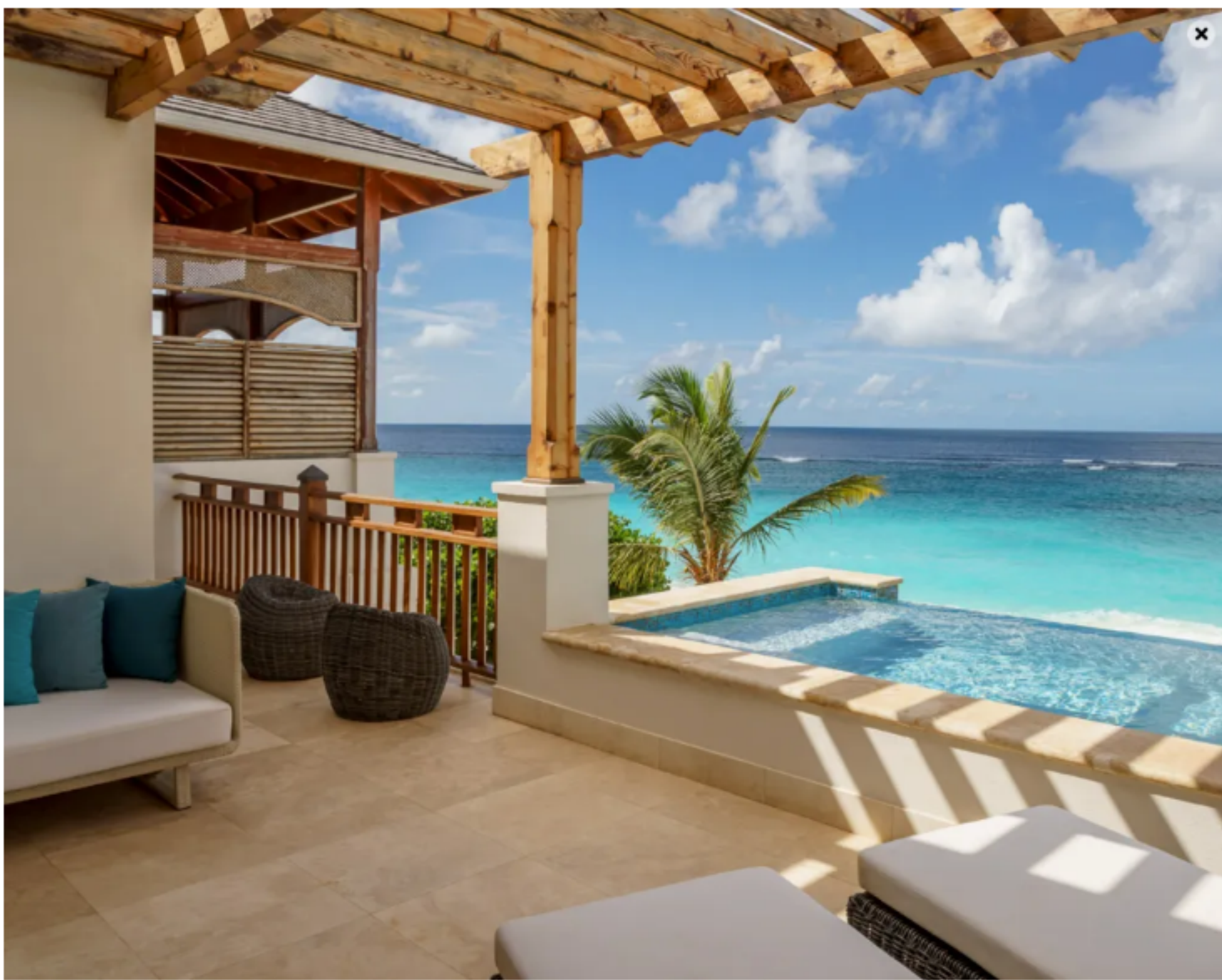
Zemi Beach House, new to LXR Hotels & Resorts, one of Hilton's luxury brands.

I love the fact that there are 65 rooms here, ranging from superior and premium rooms to one-, two- and three-bedroom penthouse suites and beachfront villas. The villas are right on the beach and each has a private pool overlooking the ocean.