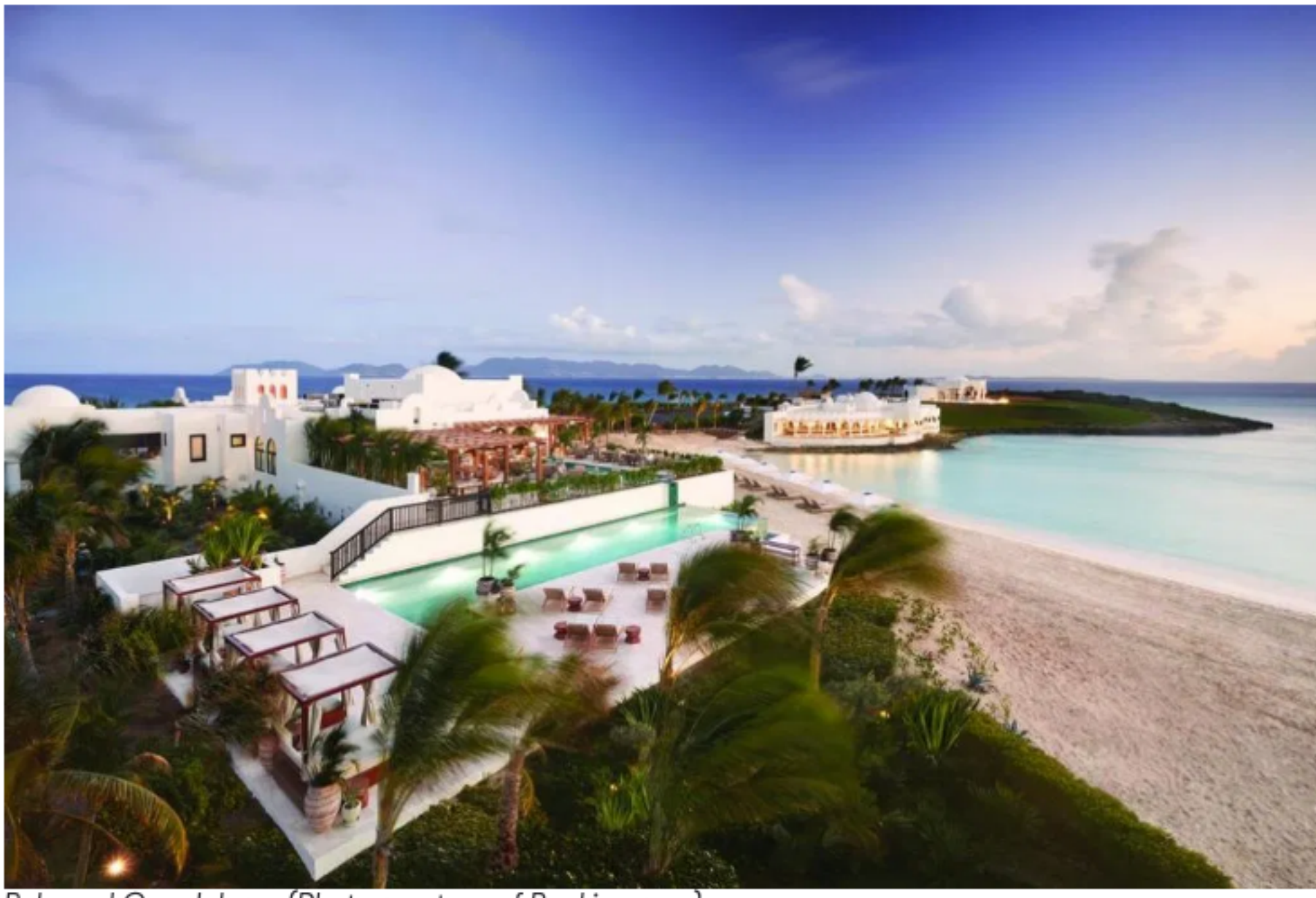
Belmond Cap Juluca.

I love the beach. There is something so peaceful and rejuvenating about vacationing on an island. Resorts with oceanfront rooms are close to my heart. Anguilla is a lovely Caribbean island that is part of the British West Indies, and we've been wanting to stay at Belmond Cap Juluca .