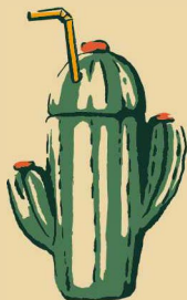
FEELS LIKE SUMMER