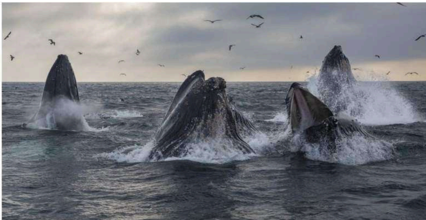
Opposite page: The Lone Cypress is a Monterey cypress tree in Pebble Beach, California. This page: Whale watching in Monterey Bay, California.