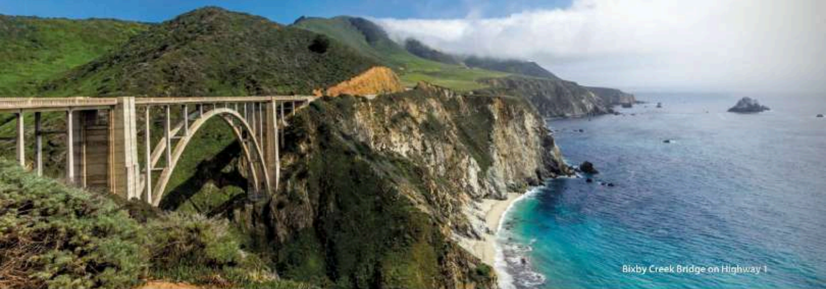
Bixby Creek Bridge on Highway 1