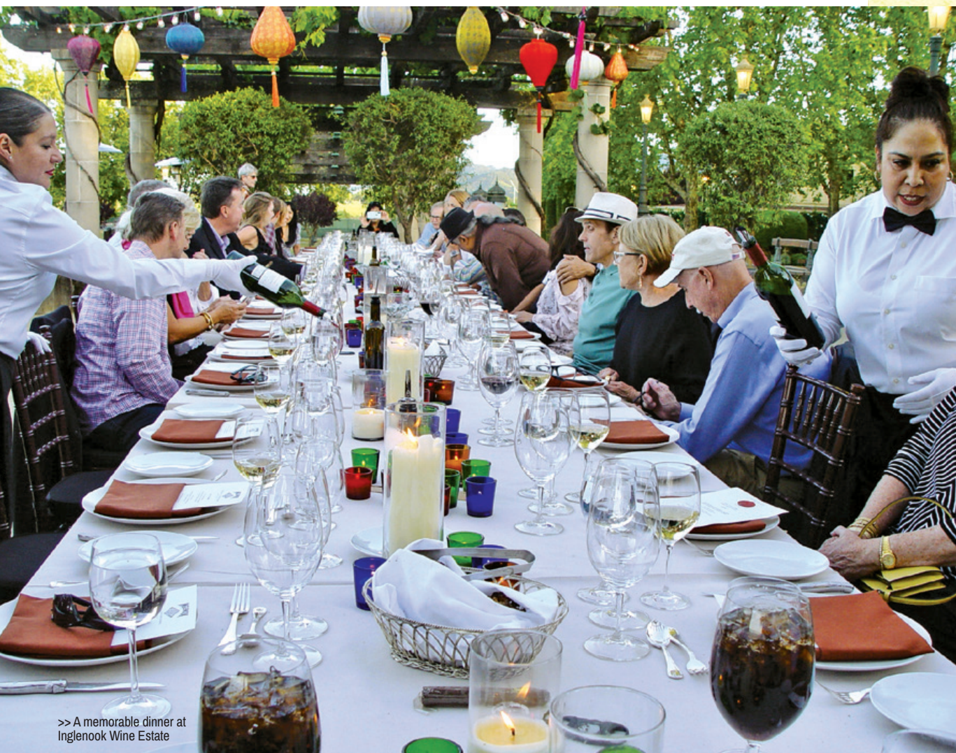
>> A memorable dinner at Inglenook Wine Estate