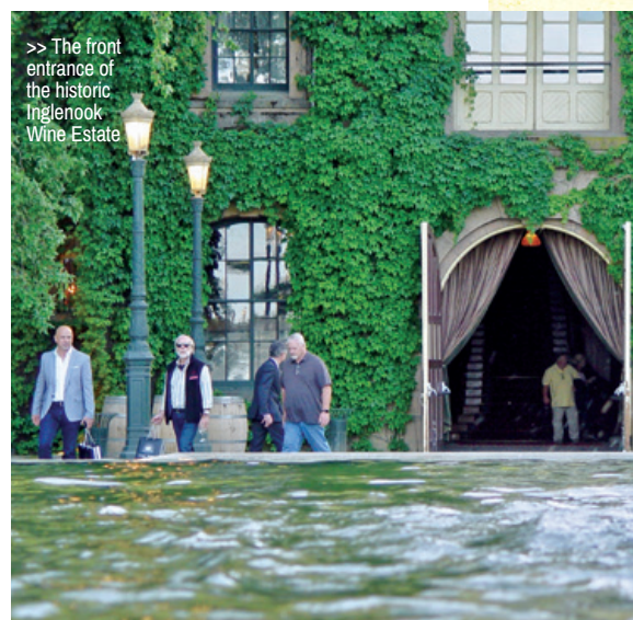
>> The front entrance of the historic Inglenook Wine Estate