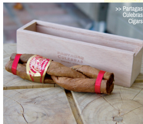
>> Partagas Culebras Cigars