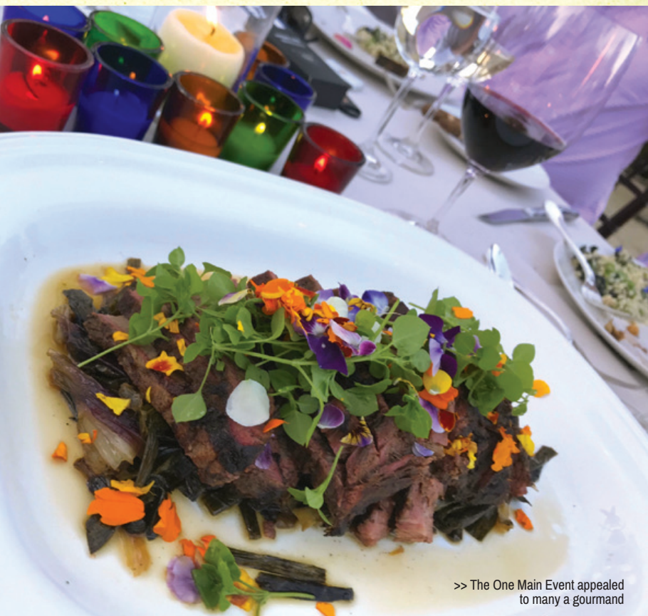
>> The One Main Event appealed to many a gourmand