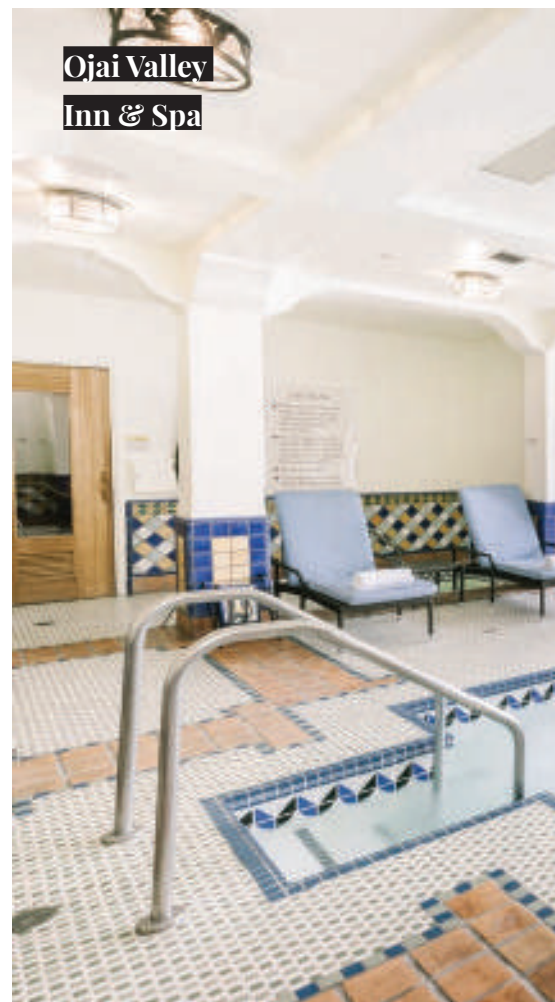
Ojai Valley Inn & Spa

For the second year in a row, Pebble Beach Resorts, a collection of six golf courses and three hotels on the storied Monterey Peninsula, takes the award in the golf category. This year marks the resorts' centennial with special attention to accomplishments ranging from the addition of Fairway One at The Lodge at Pebble Beach to complete renovation of all guest rooms across the three properties, which also include The Inn at Spanish Bay and Casa Palmero, a 24-room "resort within a resort." A new Pebble Beach Visitor Center features