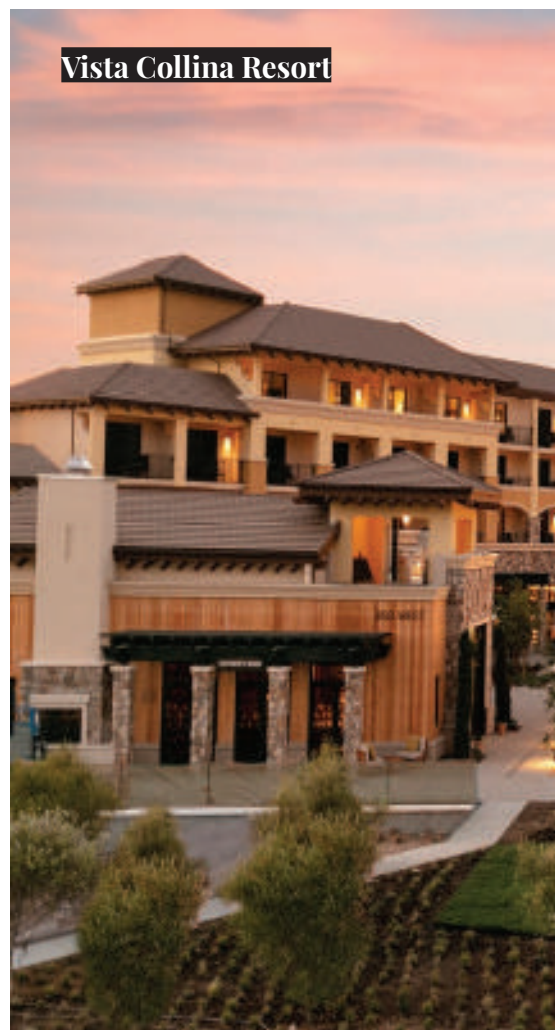
PHOTOS: VISTA COLLINA RESORT; INDIAN SPRINGS RESORT & SPA; AT&T PARK