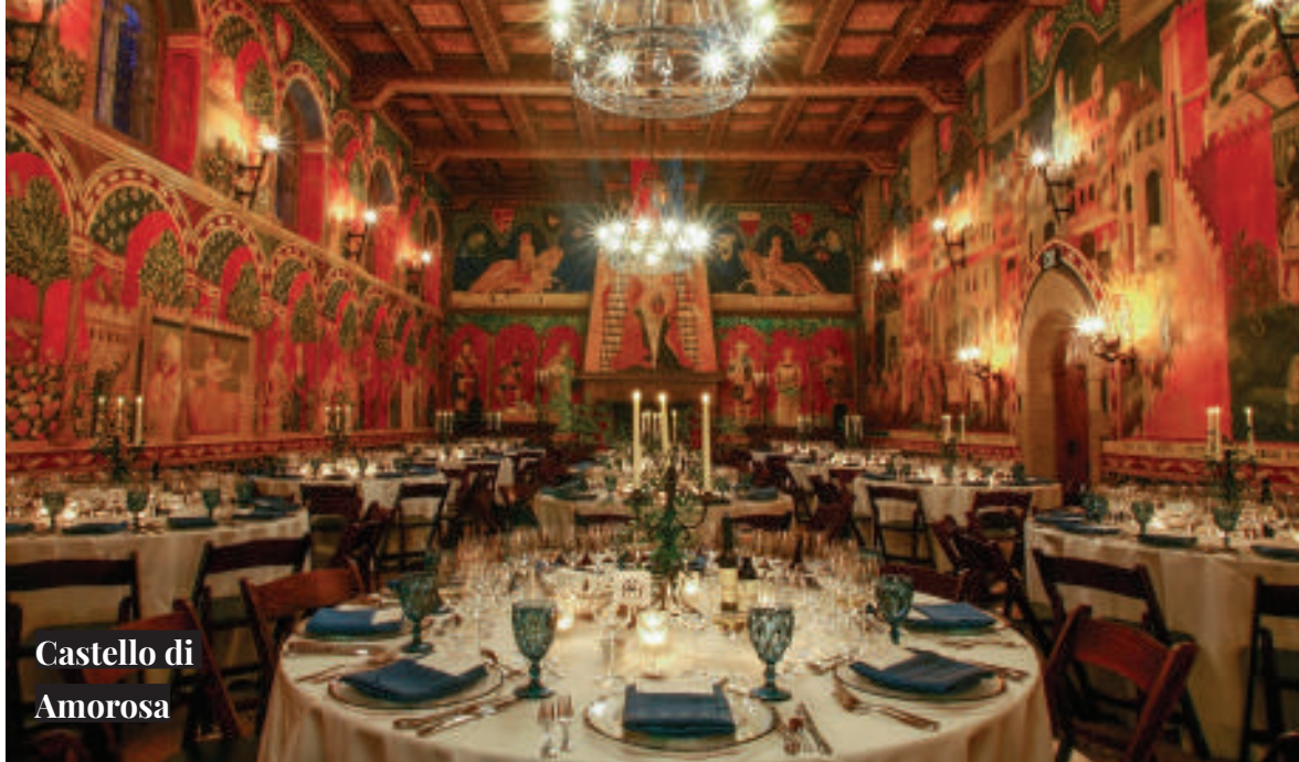
Castello di Amorosa