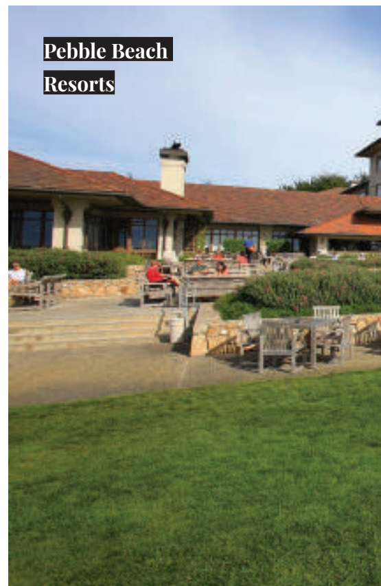
Pebble Beach Resorts