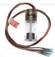
ULTRA PUMP SWITCH MINI