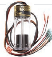
ULTRA PUMP SWITCH SR.