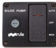
DELUXE BLACK PANEL