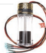
ULTRA PUMP SWITCH JR.