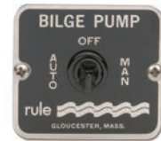
NON LIT BLACK PANEL