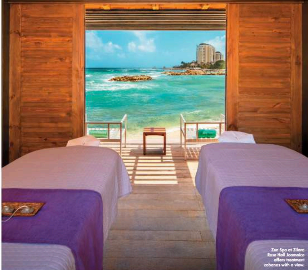
Zen Spa at Zilara Rose Hall Jamaica offers treatment cabanas with a view.

Playa Hotels & Resorts has transformed the Zen Spas at Hyatt Zilara Cancun (Mexico) and Hyatt Zilara Rose Hall (Montego Bay, Jamaica). The new spas incorporate influences from their respective Mayan and Jamaican cultures. The 22,800-square-foot Cancun spa draws its inspiration from the four cardinal directions—east, west, north, and south. Highlights include 11 treatment rooms, four couples' suites with Jacuzzis, an outdoor terrace and lounge, a beauty salon, and a hydrotherapy circuit. The Jamaica retreat features four air-conditioned beachfront treatment cabanas with views of the Caribbean Sea. Guests also have access to a new full-service fitness facility.— JULIE KELLER CALLAGHAN