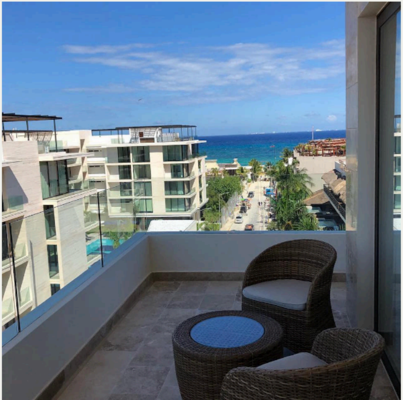
An ocean-view room.

Dining offerings include two restaurants, one buffet and three bars, from the Mexican eatery Cachito to the Asian-inspired El Asiatico.