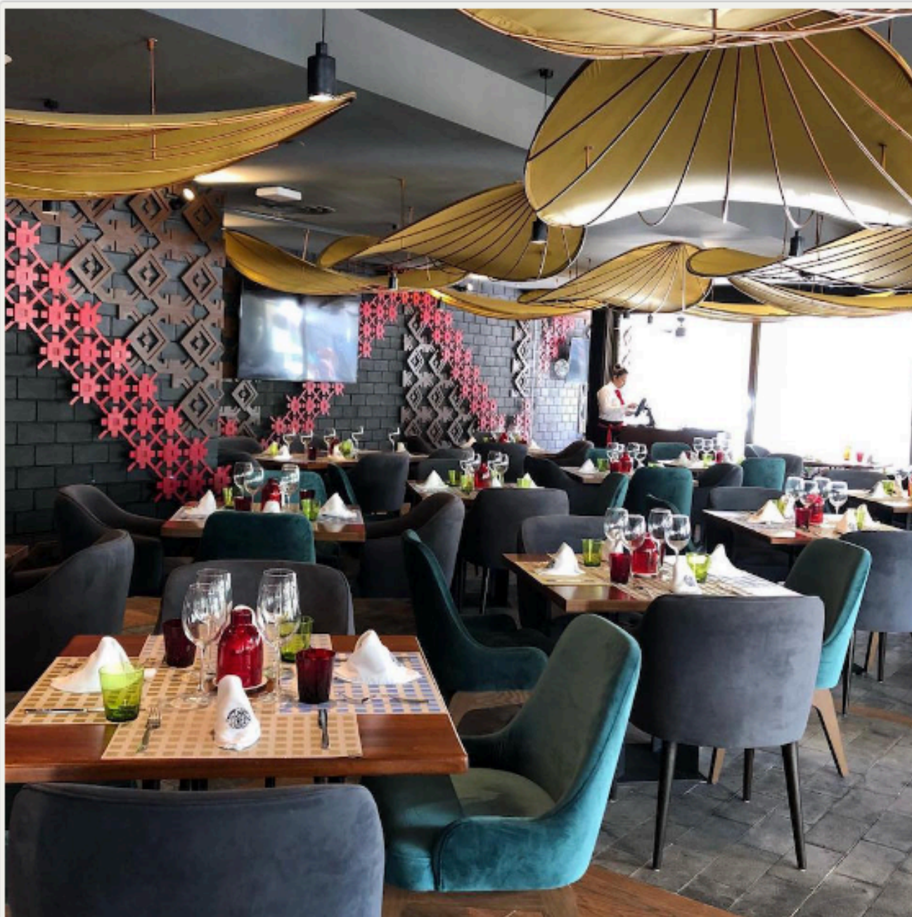
Cachito, the property's Mexican eatery.

There's also a full menu of spa services, including beachside massages.