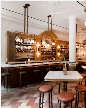
Vini e Fritti