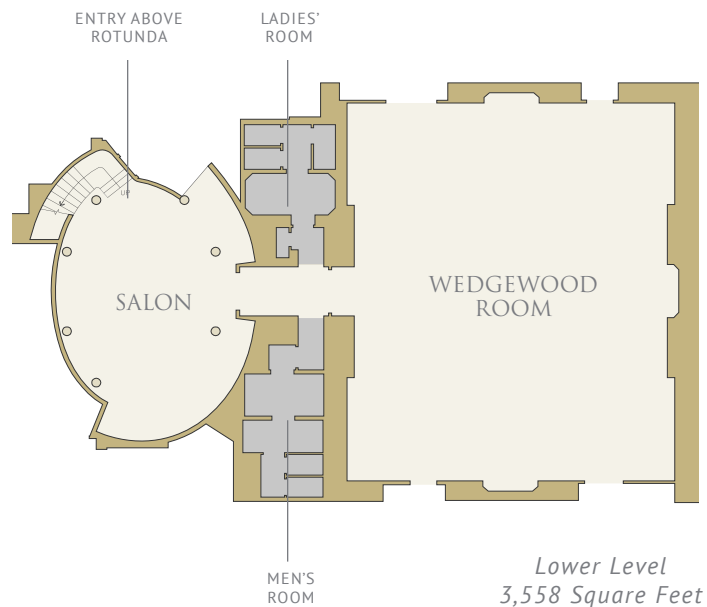
Lower Level 3,558 Square Feet