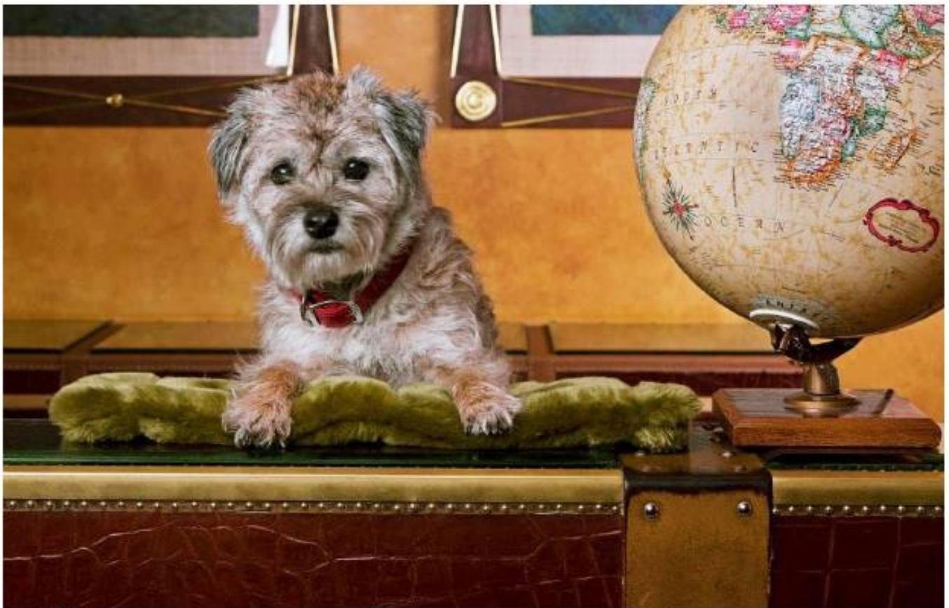
The Marker FACEBOOK: THE MARKER

For a more traditional Union Square area stay that still honors the creativity and vibrancy of the neighborhood and its cultural history, The Marker is a recently renovated Beaux-Arts-style hotel featuring eye-catching jewel tones and pattern-packed accents. Formerly the Bellevue Hotel and long known for hospitality and service, pets are welcome to join you at this premier property for a fee of $75 each (up to 2) and will receive food and water bowls, treats and comfy beds.