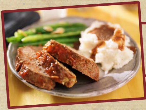
Mom's Meat Loaf Secret recipe, mashed potatoes & gravy, seasonal vegetables $13

All entrees served with dinner salad with choice of dressing