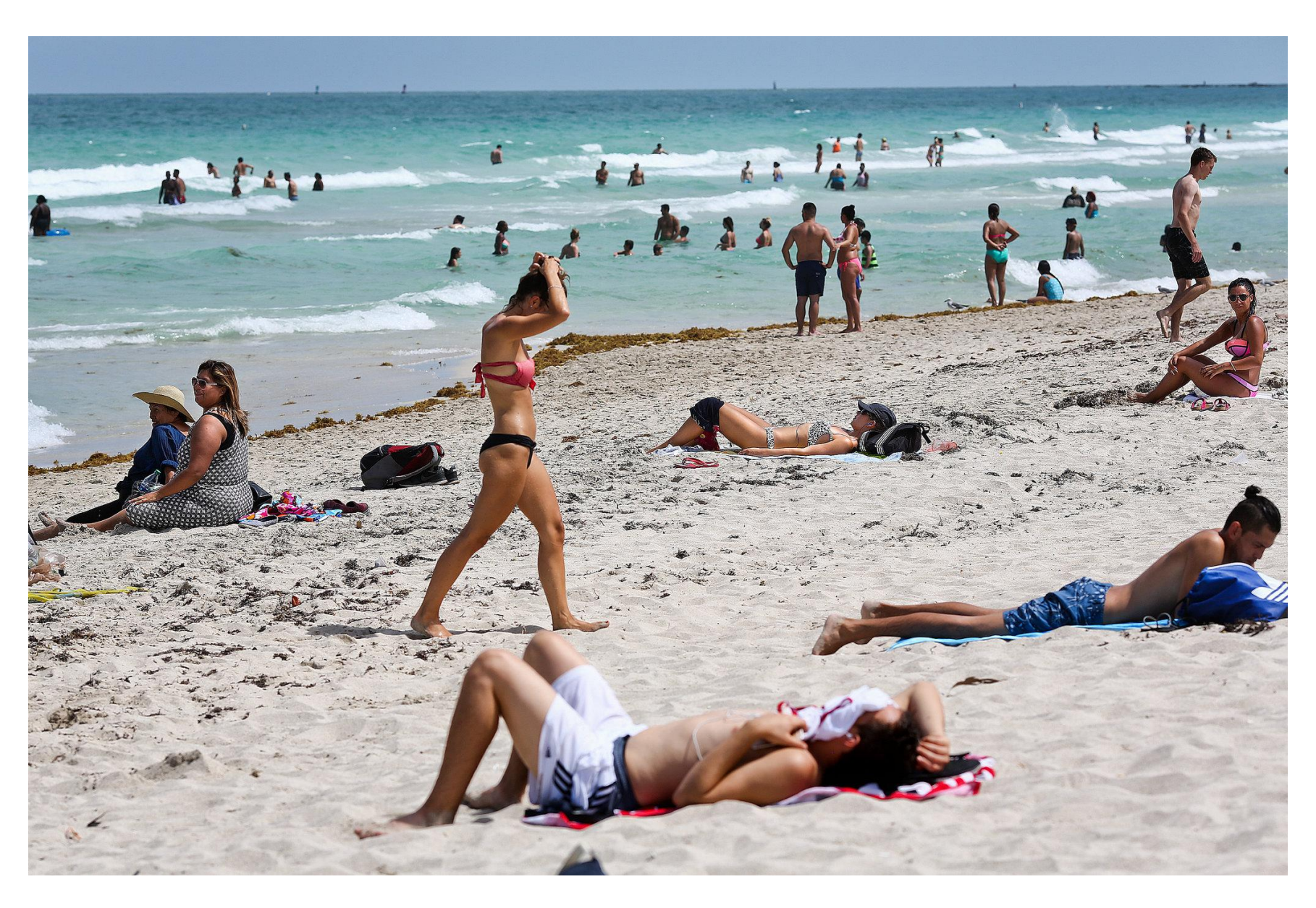
South Beach in Miami, among the classic and most popular spring break destinations.

A record number of people are expected to fly the nation's airlines this spring between March 1 and April 30, an all-time high of about 151 million