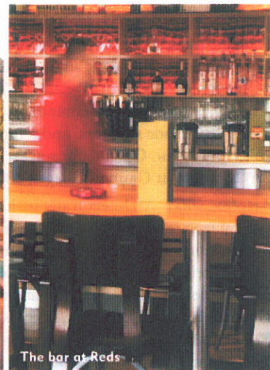
The bar at Reds