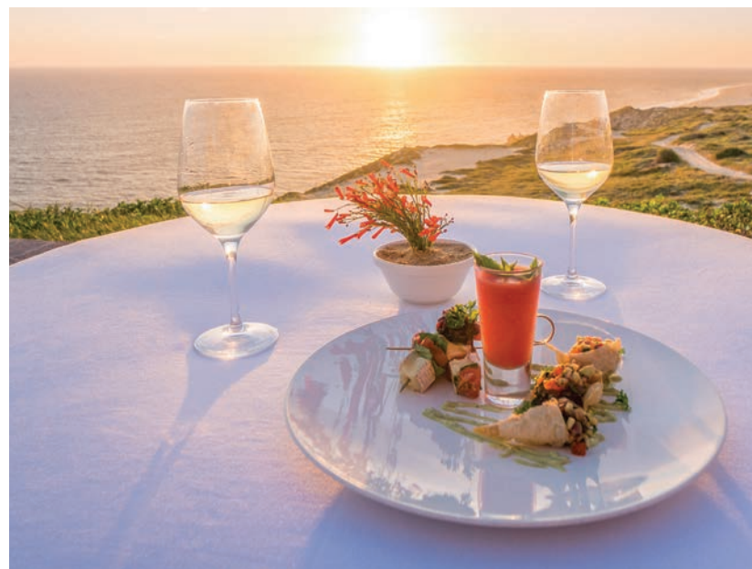
(ABOVE AND FAR RIGHT) | THIS PAGE: Hole 15. OPPOSITE PAGE: Sample Custom Villa.

Troy and the original Planet of the Apes). The iconic lighthouse provides a link to southern Baja's historic past and serves as the centerpiece for the namesake community.