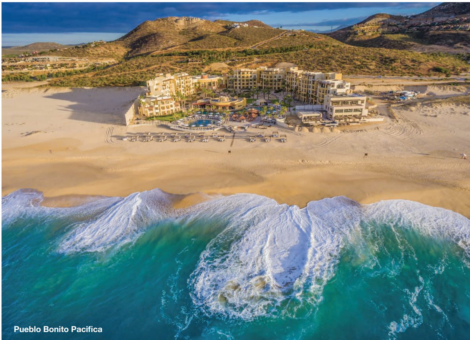
Pueblo Bonito Pacifica

In addition to golf, Los Cabos offers a myriad of other ways to have fun in the sun. You can go sportfishing for marlin, tuna, and other trophy catches just minutes from shore. Boating excursions to see The Arch or go whale-watching are popular, too—as are the diving and snorkeling in the clear, blue waters.