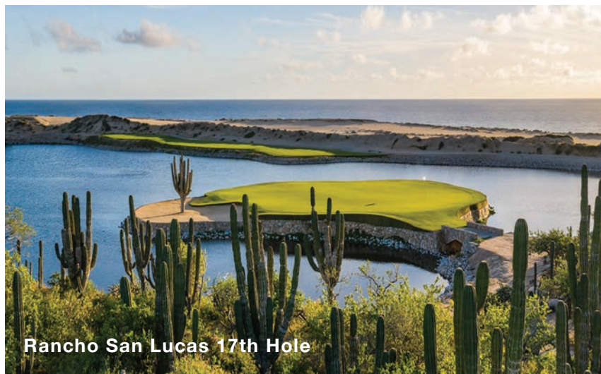
Rancho San Lucas 17th Hole