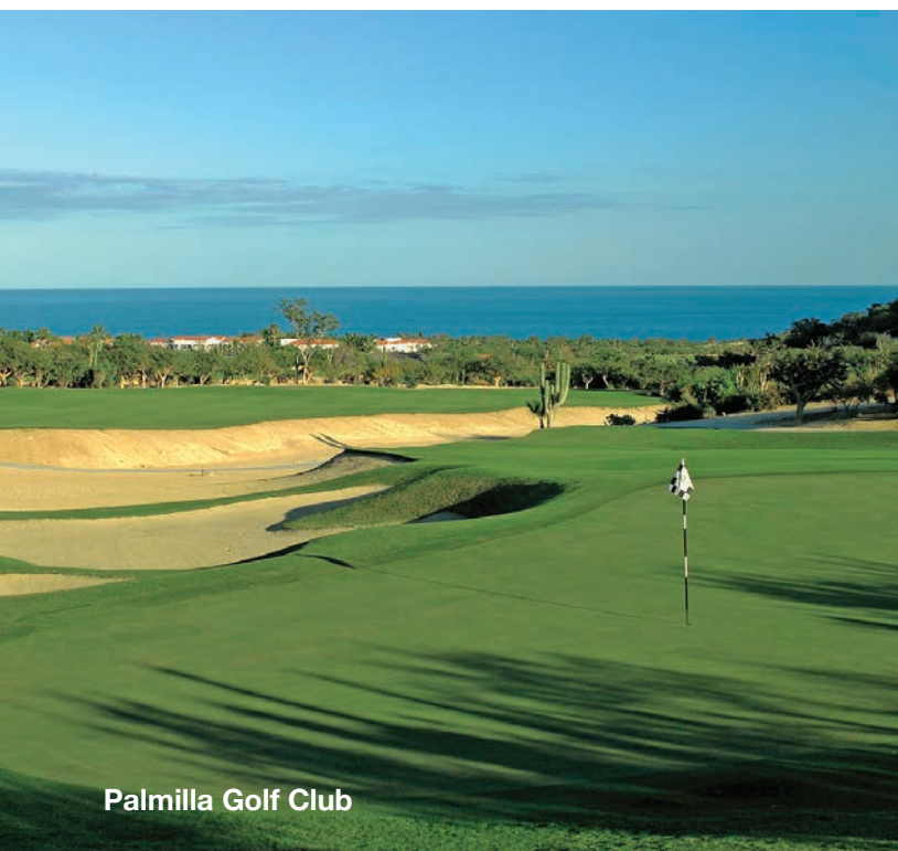
Palmilla Golf Club

To book your golf experience in Los Cabos, go to www.CaboGolfLife.com , where the very best of Los Cabos is just a click away.