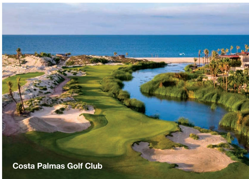
Costa Palmas Golf Club