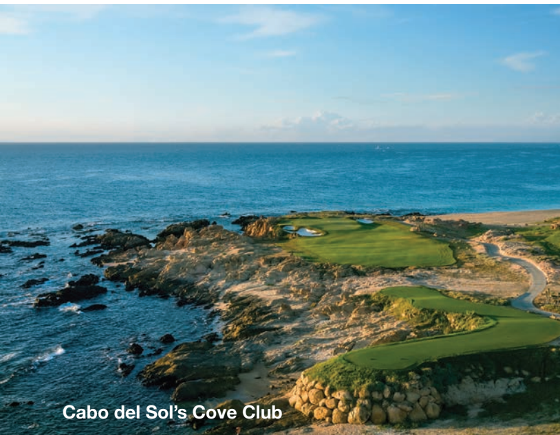
Cabo del Sol's Cove Club

tequila, and to go where the desert meets the mighty Pacific – Los Cabos. People who haven't traveled there will be astounded at how good it is. For those who have visited before, it's the perfect time to go back." For Cabos San Lucas Travel Safety Information go to: visitloscabos.travel/industry/los-cabos-with-care/ 🏠