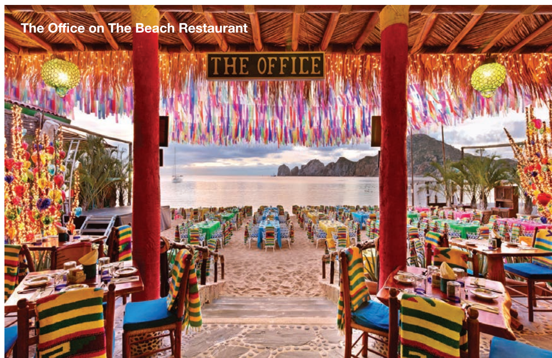
The Office on The Beach Restaurant

> Chileno Bay GC - requires stay at Chileno Bay Resort, a stunning