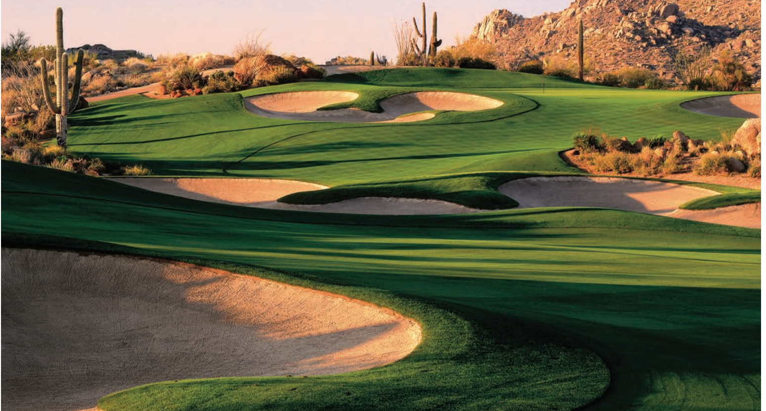
Four Seasons Resort Scottsdale at Troon North