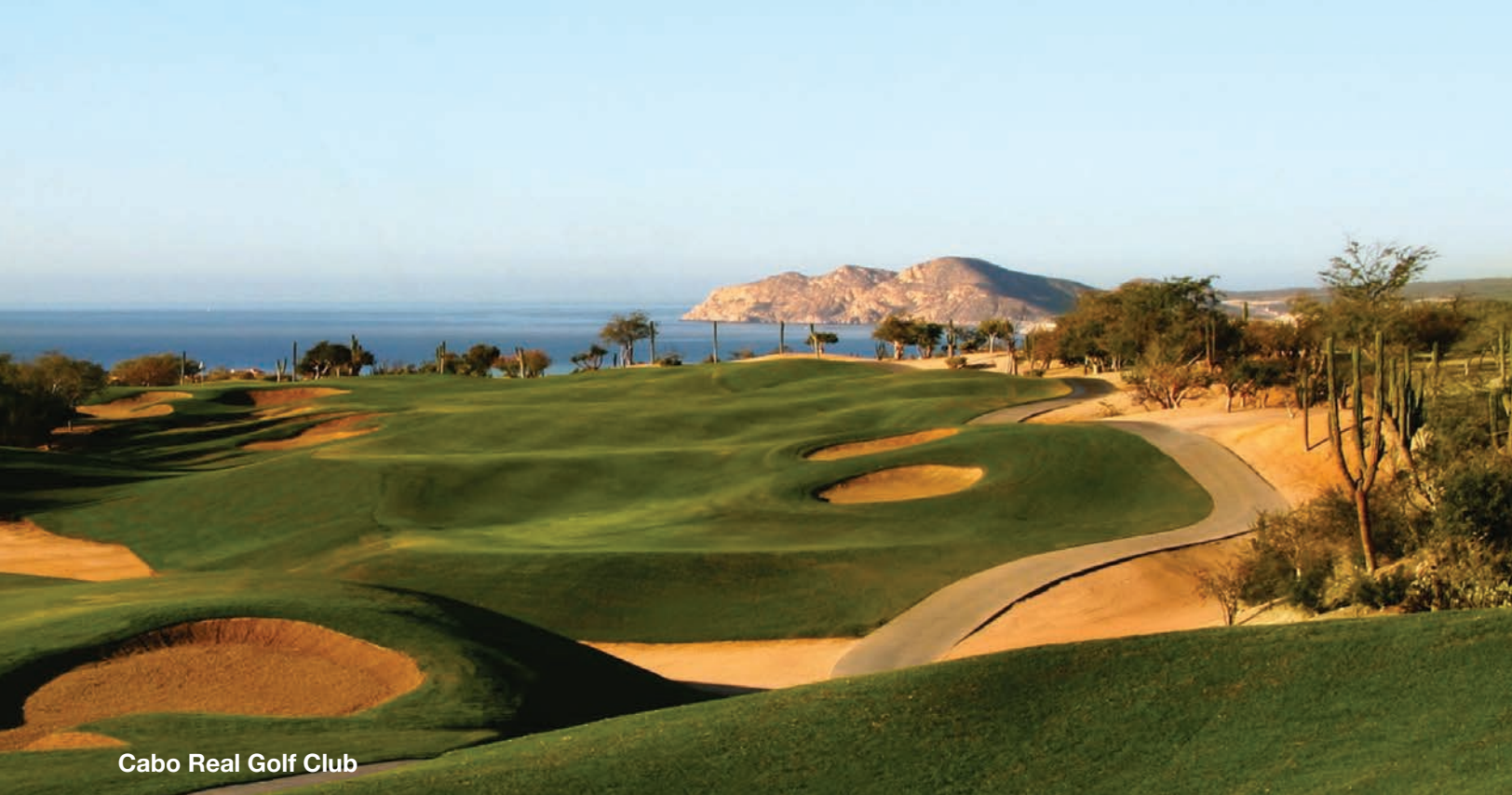
Cabo Real Golf Club

The golf in Los Cabos is a lot like what you'll find in the American southwest. It's target golf on ribbons of emerald green turf, only with stunning ocean views. You'll enjoy dramatic views of the sea from every course—when you're not contending with sandy waste areas and ball-hungry arroyos or stopping for refreshment at the courses' bountiful comfort stations, or chocitas, where smiling chefs serve up fresh fish tacos and players oil their swings with bracing nips of mezcal.