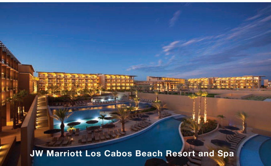
JW Marriott Los Cabos Beach Resort and Spa