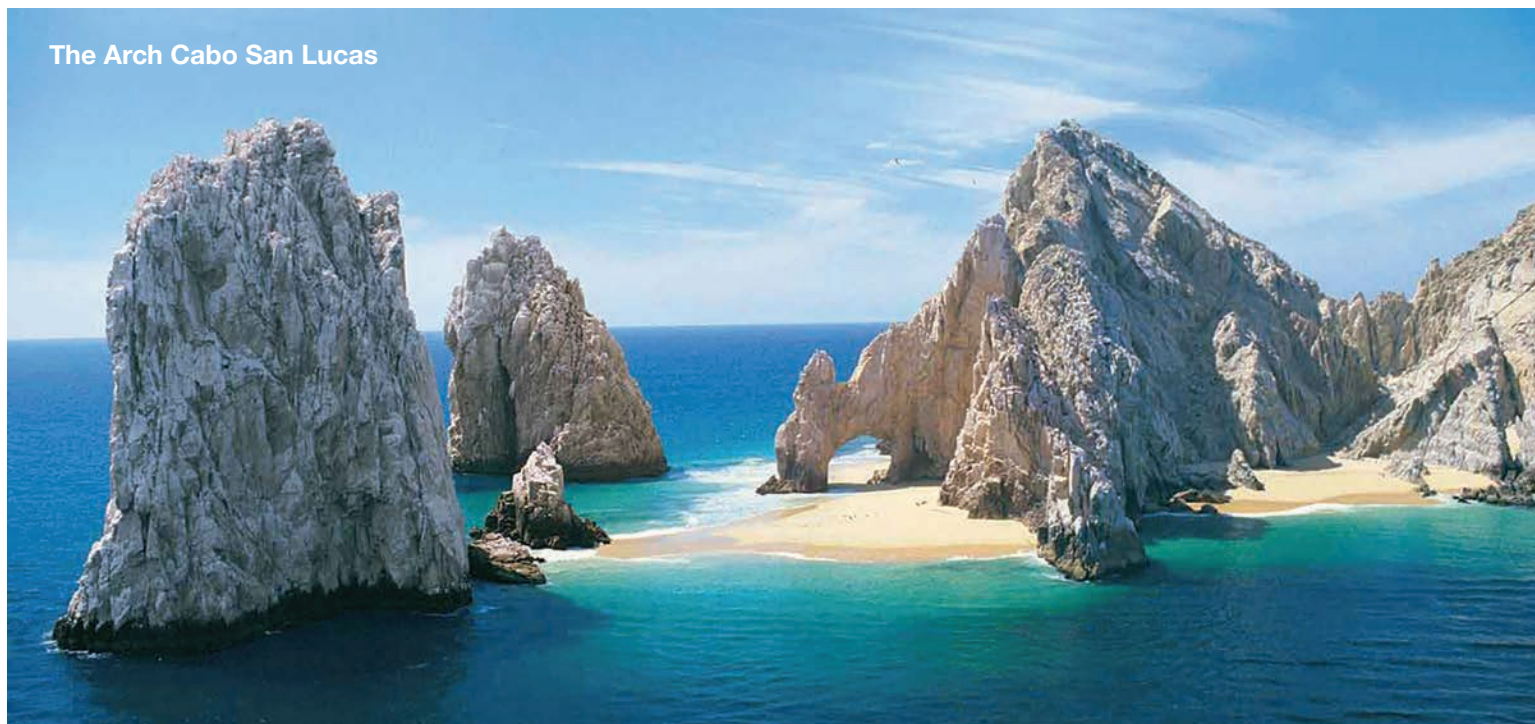
The Arch Cabo San Lucas

already mentioned, other great options include the J.W. Marriott with its clean, ultramodern design; The Waldorf Astoria Los Cabos Pedregal, situated in its own private cove surrounded by cliffs; and Esperanza, another Auberge property that's a favorite of the Hollywood crowd.