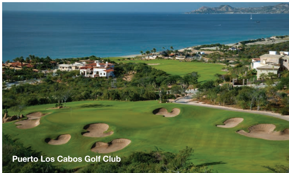
Puerto Los Cabos Golf Club

From the minute you land at San Jose del Cabo International Airport, you'll know you're in for a special experience. Within steps of the arrivals hall, Los Cabos welcomes you with a phalanx of lively, open-air bars. Stopping for an ice-cold cerveza or margarita before you head to your hotel is practically mandatory. En route to your hotel, you'll quickly get a feel for what makes this area so special, the red sandstone mountains, the cactus-laden desert crisscrossed by dry arroyos, and ultimately, the sparkling sea.