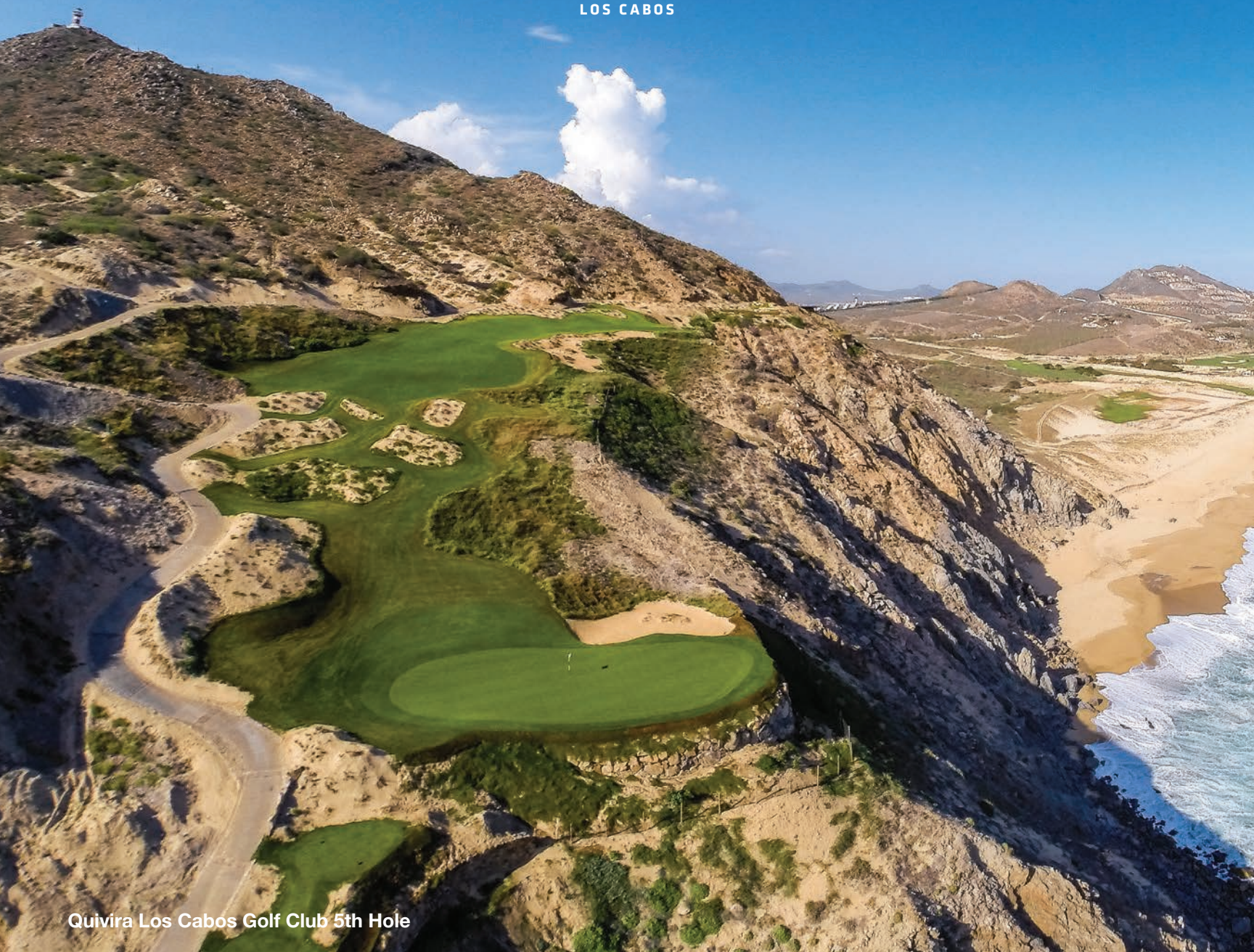
Quivira Los Cabos Golf Club 5th Hole