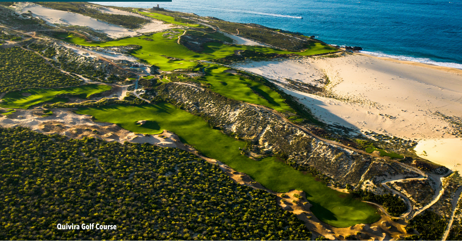
Quivira Golf Course