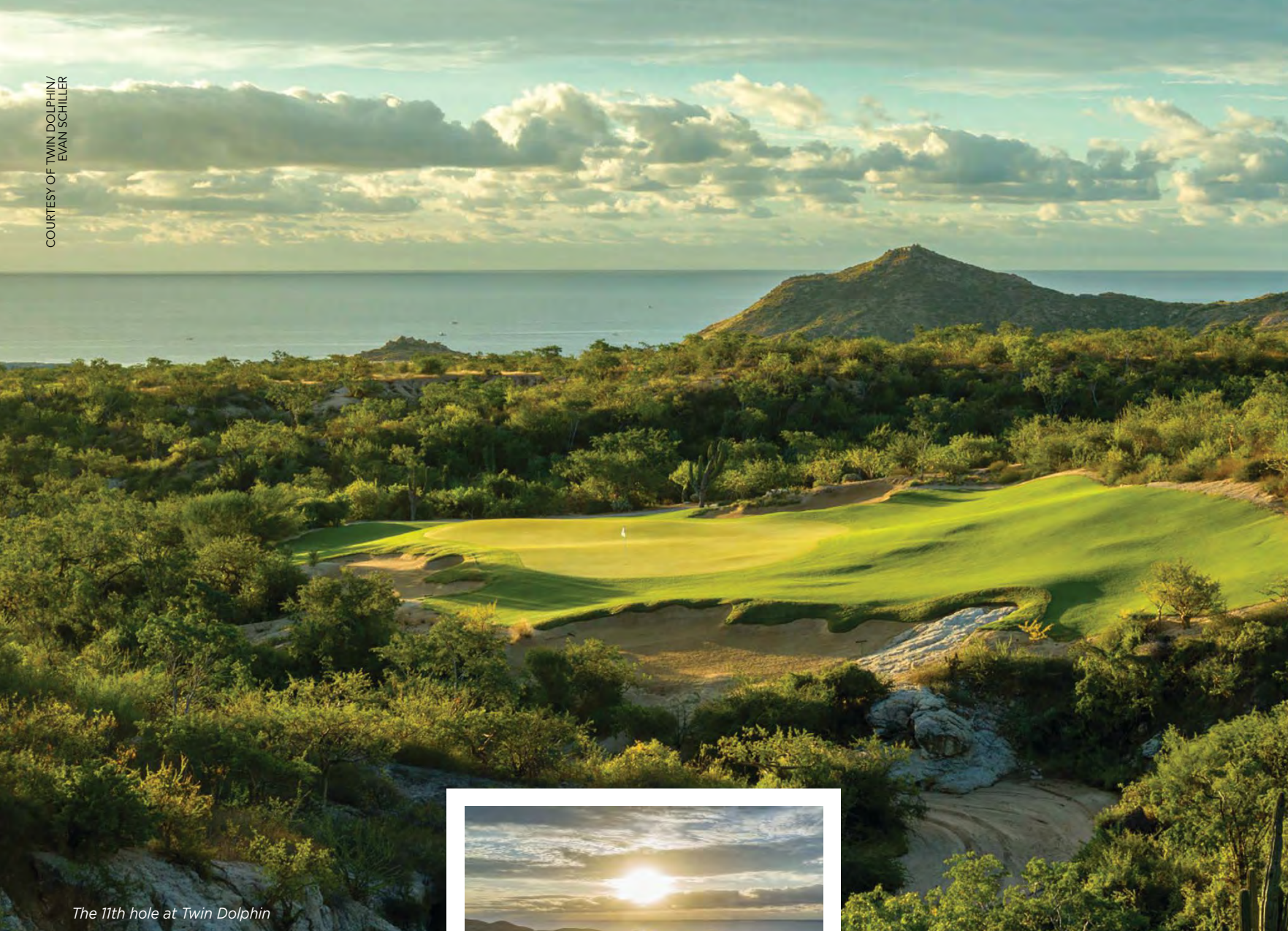
The 11th hole at Twin Dolphin