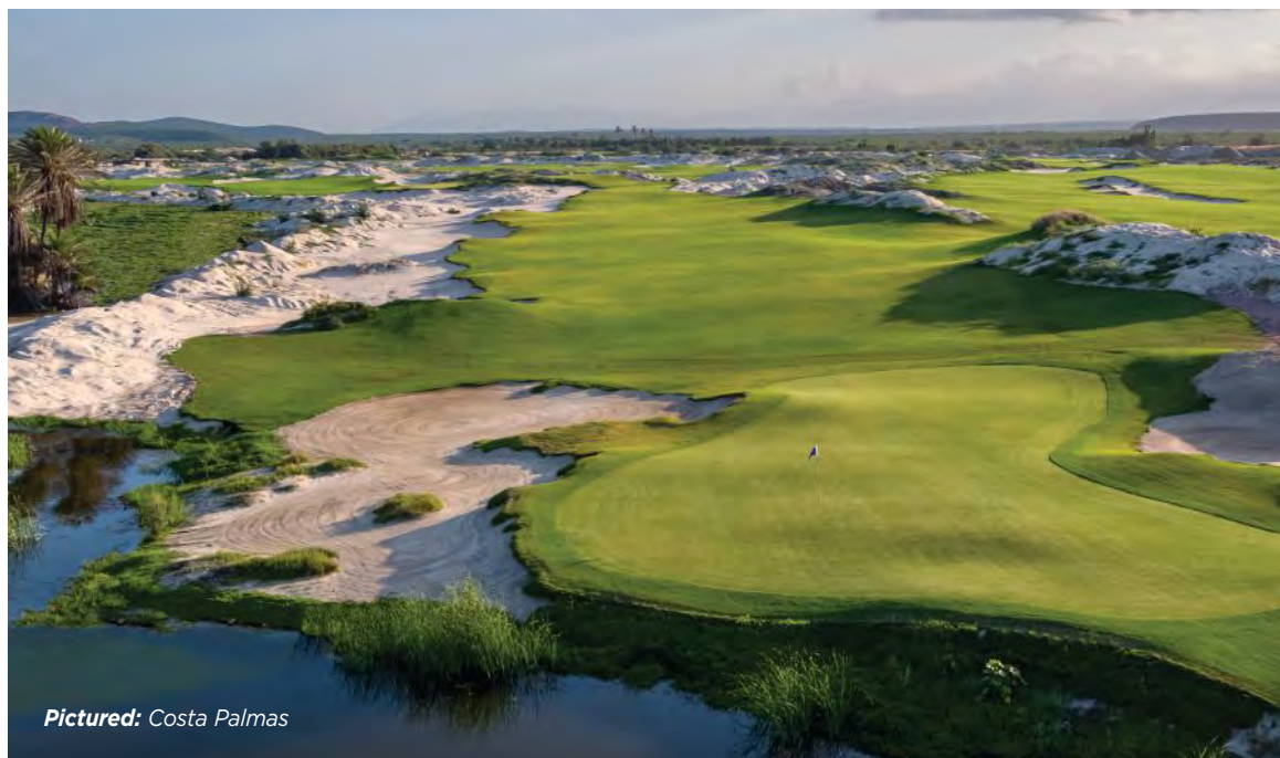
Pictured: Costa Palmas

This is not Pine Valley or Seminole. This is Cabo. Untuck your shirt, grab a margarita, crank up the tunes, forget about your score and enjoy. Gwk