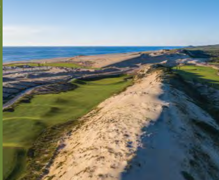
Rancho San Lucas