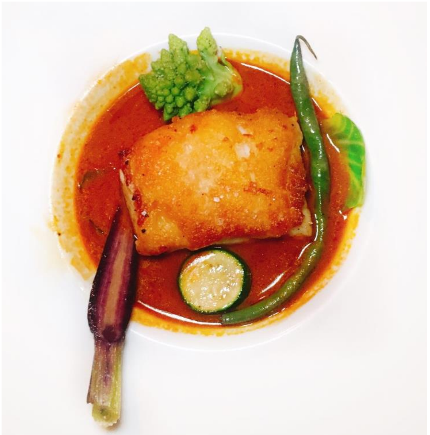
LaFrida Traditional "Mole de Olla" Sea Bass

With five resort properties across Los Cabos, each has their own ambience and amenities. Selecting the all inclusive pass as a guest of The Towers at Pacifica gives you the opportunity to explore the other locations to give you a taste of what can be found at Pueblo Bonito resorts. Easily accessible shuttle services will whisk you to the location of your choosing. Whether you decide to have breakfast at Palomas Restaurant at Pueblo Bonito Los Cabos, fine dining at award winning LaFrida at Pueblo Bonito Sunset or sushi at Pescados at Pueblo Bonito Pacifica, the choice is yours.