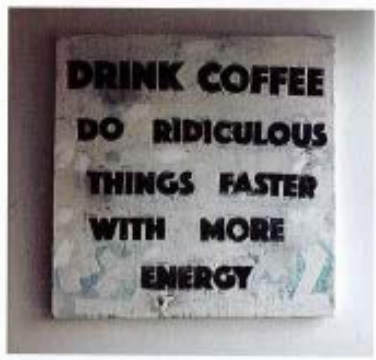
TOP Each cool and contemporary guest room is adorned with a playful beach ball. LEFT Surfboards mounted directly on a lobby wall serve as beach inspired artwork. ABOVE A sign outside the coffee shop is a reminder that this is a hotel with a sense of humor.