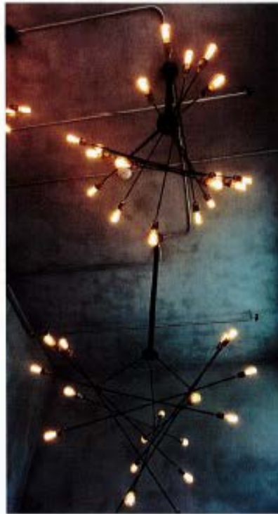
CLOCKWISE FROM TOP Oceanfront room; a "grassy" ottoman room decoration; industrial style light fixtures at the entrance; a view from the beach; there is a chalkboard in every room — we used ours for love notes. Don't hate us.