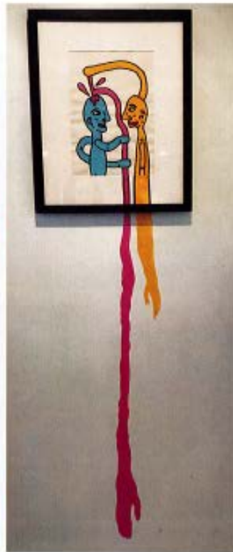
FAR LEFT Hand-painted frames with retro photos line the hotel hallways. LEFT Plunge has an eclectic collection of art sure to bring a smile.