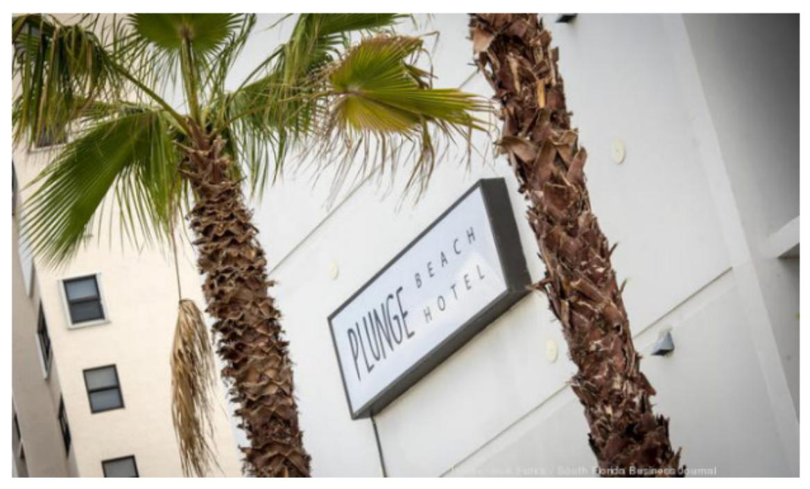
The Plunge Hotel opened in 2017 and offers a myriad of entertainment choices.

LAUDERDALE BY THE SEA, Fla. – There are not too many places remaining in South Florida where someone can find a hideaway beach resort. One of those places, however, is Plunge Beach Hotel in Lauderdale by the Sea.