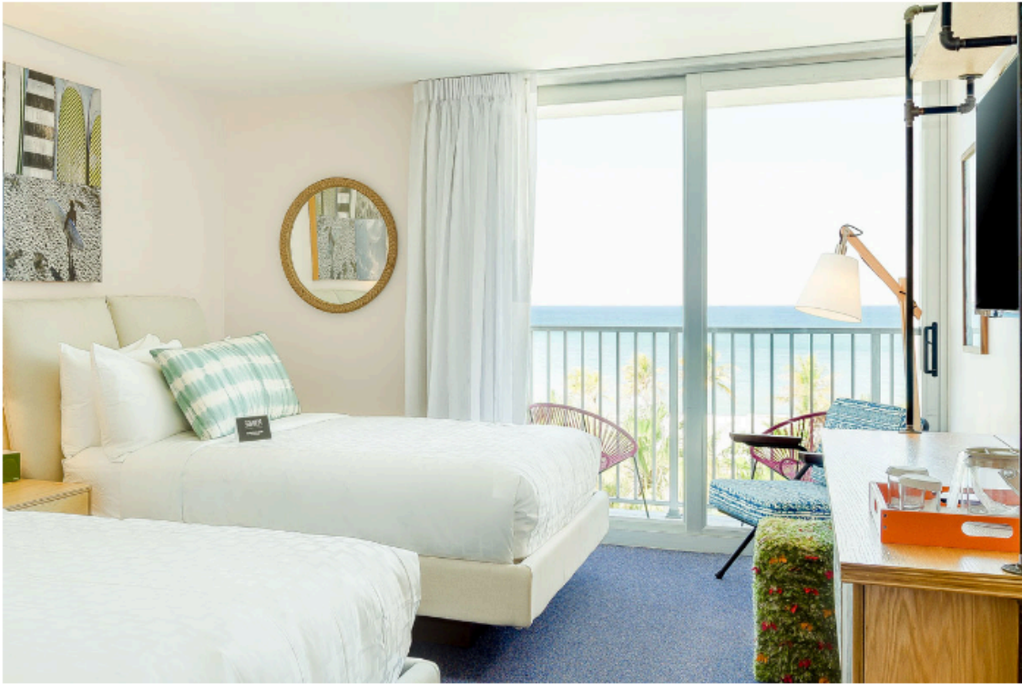
Plunge Beach Hotel view to the ocean from a room.

My recent weekend stay at one of their ocean-front room was like being on a tropical island in the Caribbean, as my room's spacious terrace literally opened out right onto a small grassy garden area with bright green lizards scurrying about, then beyond that, white sands leading to the ocean. A bright striped beach ball awaited on my big comfy platform bed, while the bathroom had a cool wooden slab counter, huge shower and high end herbal bath products. Modern amenities of Bluetooth capabilities, a 50-inch LED HD television, a large in-room safe, and a mini-fridge added to the comfort.