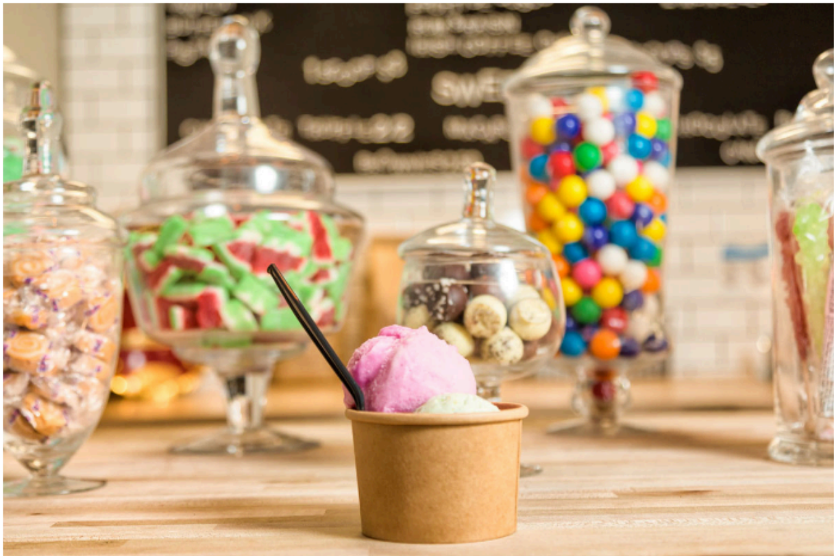
Savory food from the Bean & Barnacle at Plunge Beach Hotel

I tried their crab fritters with charred corn and bacon and also the lime-coconut coco mussels. I also tried their namesake octopus, served with white beans, and the server suggested the blackened mahi, done to perfection with sautéed spinach and fingerling potatoes.