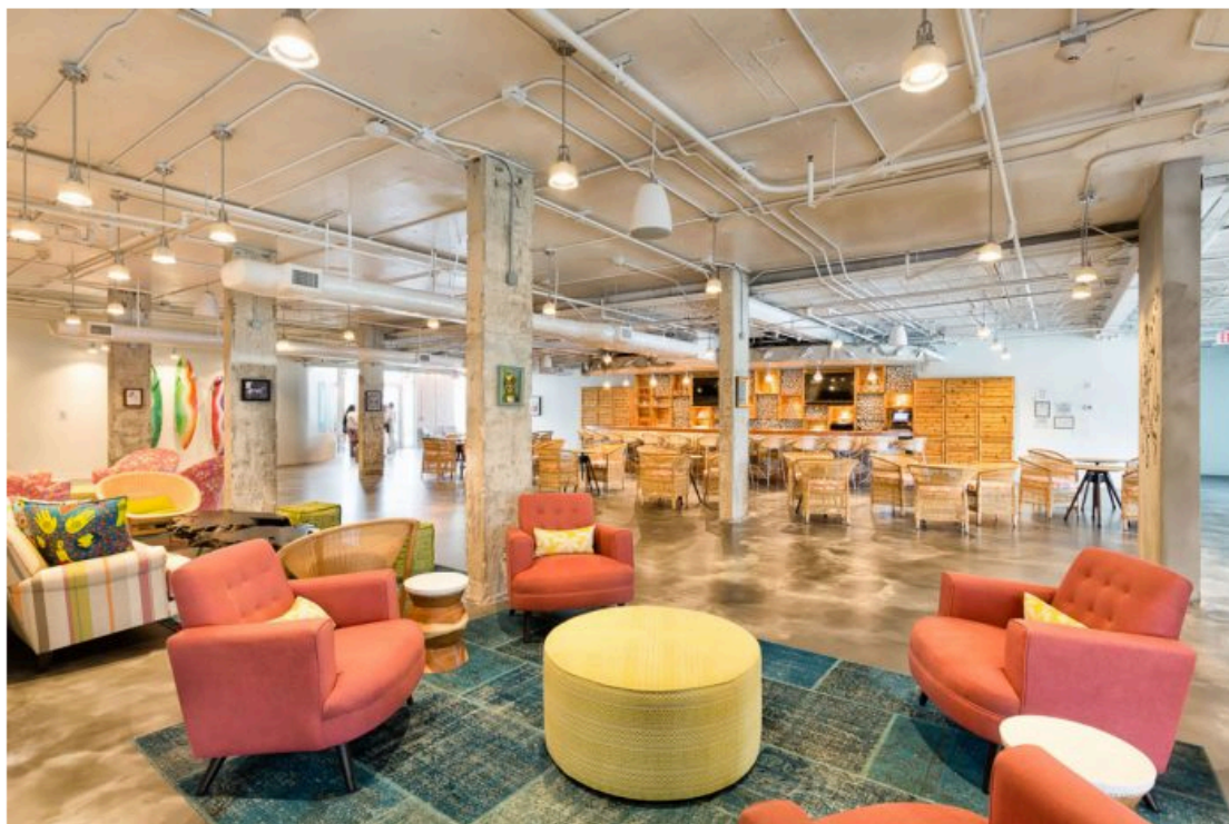
View of the Lobby at Plunge Beach Hotel

By Sandra Schulman (Art & Entertainment Senior Writer) × 07/17/2019