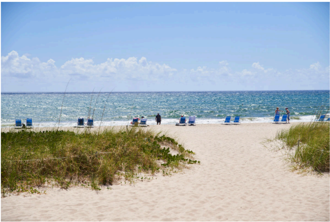
View of the beach at Plunge Beach Hotel

And for lunch, the backflip Beach Bar sits right on the sand, the only toes-in-the-sand beach bar in Lauderdale-by-the-Sea. Hmm, what to choose from – Garlic Shrimp Tacos, Yucca Fries & Queso, Grilled Romaine Salad with avocado and toasted pepitas, or maybe the signature Backburger with Colby Jack cheese, bacon, avocado and chimichurri mayo.