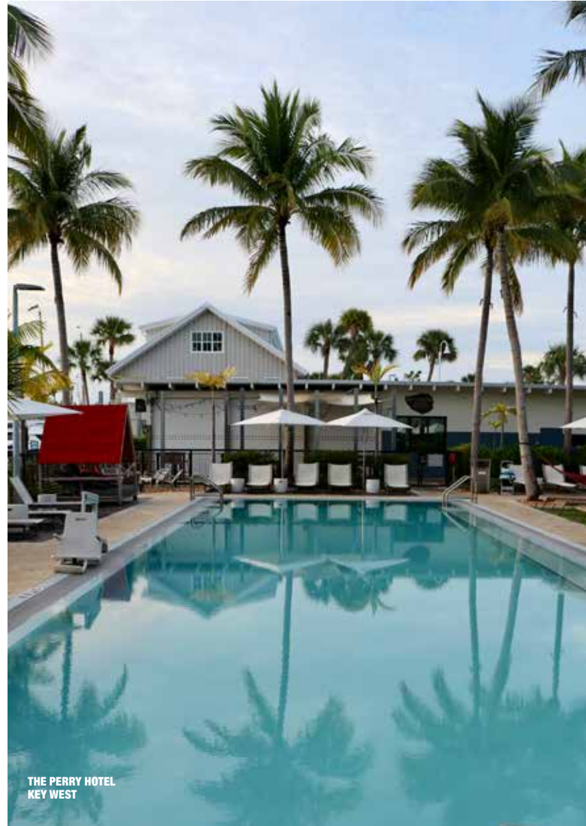
THE PERRY HOTEL KEY WEST