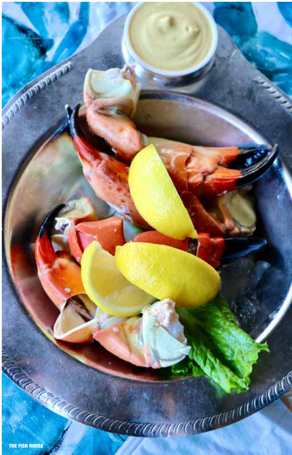
THE FISH HOUSE