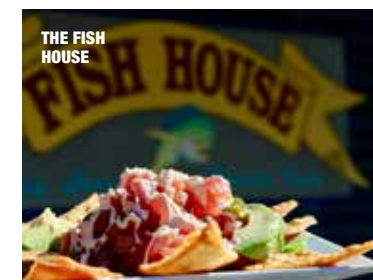
THE FISH HOUSE