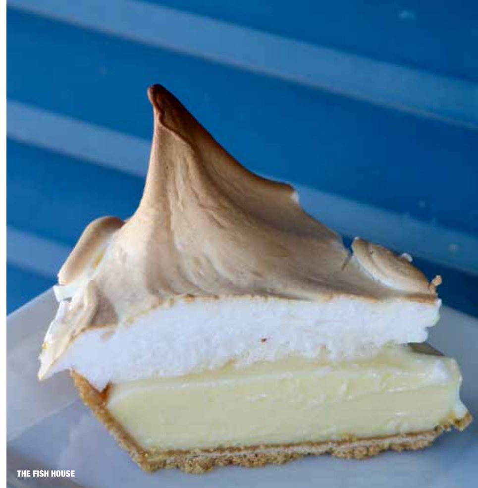
THE FISH HOUSE

Look for the lime-green and yellow corner restaurant and shop, and belly up outside next to the tranquil koi pond for a little slice of paradise. You can have breakfast or lunch all day, then shop for souvenir key lime products (everything from candy, oils, seasonings and juice to salad dressing, cookies and snacks). There are many variations of a classic key lime pie (an old family recipe of owner Kermit Carpenter), but the most unusual thing on the menu is a pie bar (a slice dipped in chocolate).