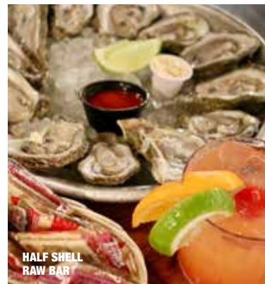
HALF SHELL RAW BAR