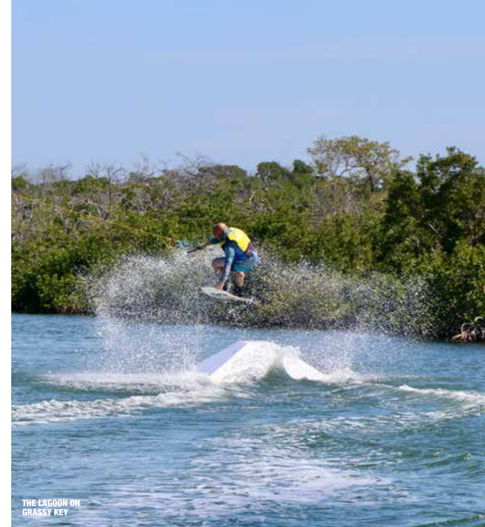
THE LAGOON ON GRASSY KEY

Make a pit stop afterward at No Name Pub for a local beer and smoked tuna dip, and on the way, be sure to look out for the miniature deer that inhabit the area.