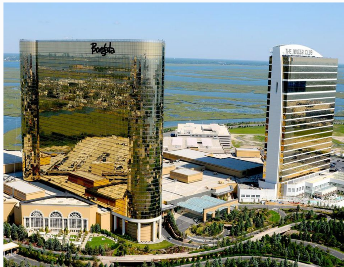
Borgata Hotel in Atlantic City.

Hotel Commonwealth , located in the heart of Boston's Kenmore Square just steps from Fenway Park, is celebrating the Red Sox and its record-breaking 108-win season with an exclusive Cyber Monday deal. Beginning November 26, 2018 at 1:08 p.m, you can book rooms for just $108 per night, for stays through March 14 (108 days). Book quickly because this record-breaking offer will only last for 108 minutes. Some restrictions and blackout days apply.