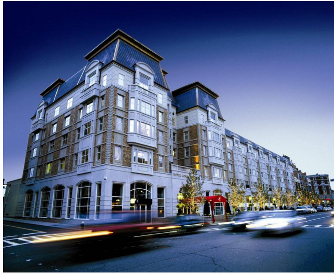
Hotel Commonwealth in Boston.