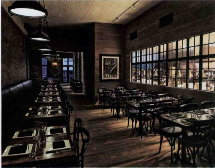
> Firewood restaurant is the new bite in town on Park City's Main Street.

Continued from page 61 adventures like fly-fishing on Alexander Creek. The property is an anchor amenity of Blue Sky Utah, a 3,500-acre hospitality and recreational complex 16 miles north of Park City.