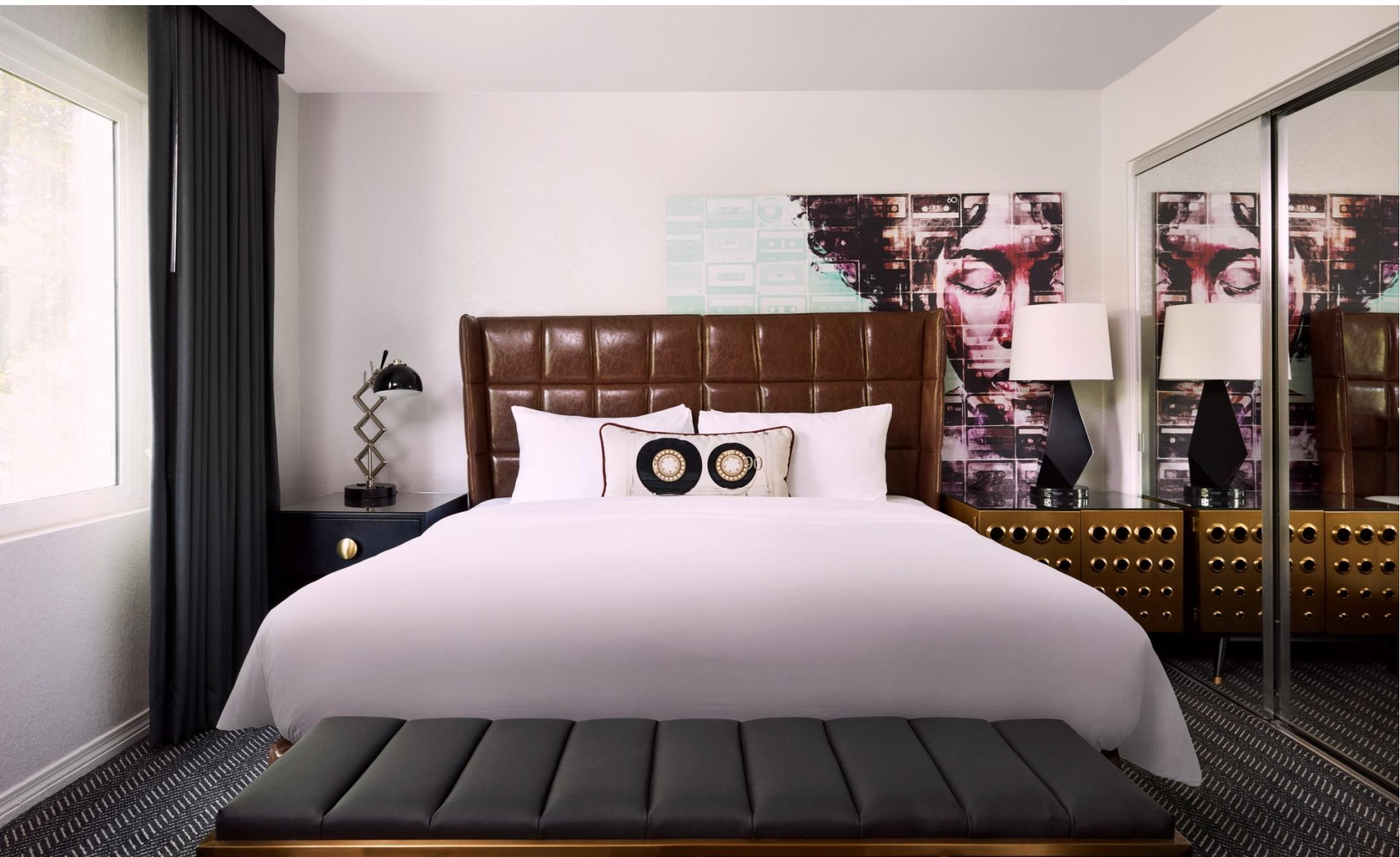
DELUXE ONE BEDROOM SUITE