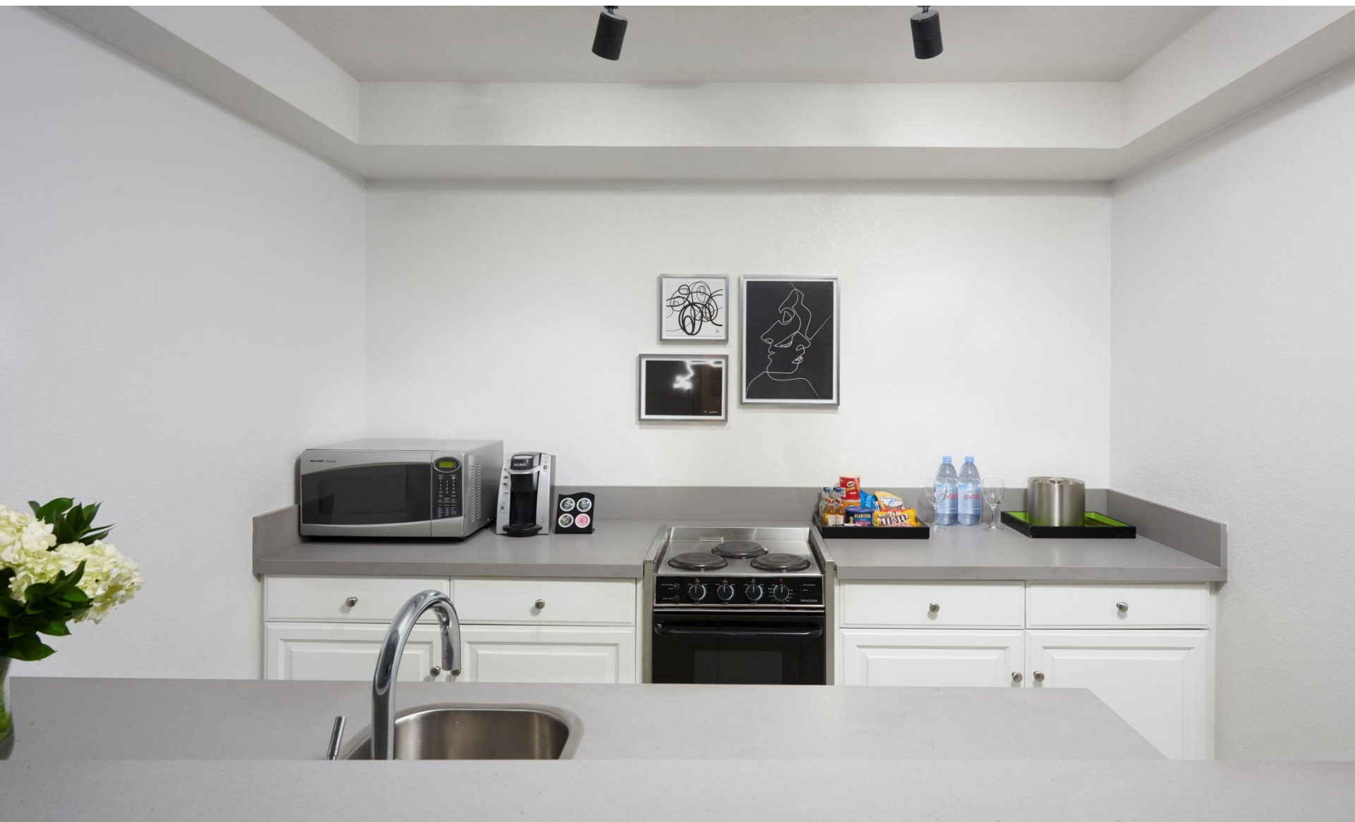
DELUXE ONE BEDROOM SUITE KITCHEN