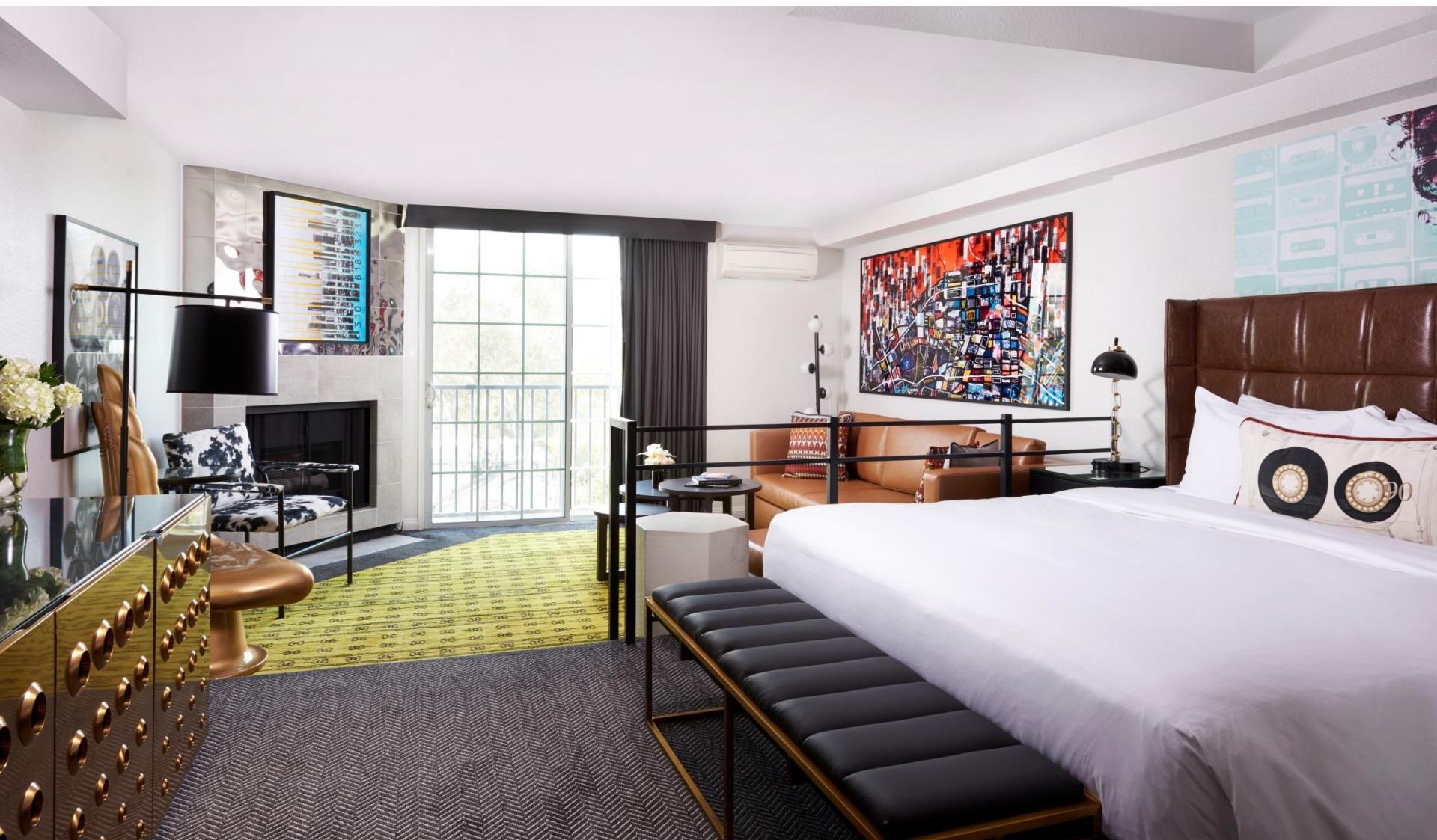
DELUXE KING SUITE