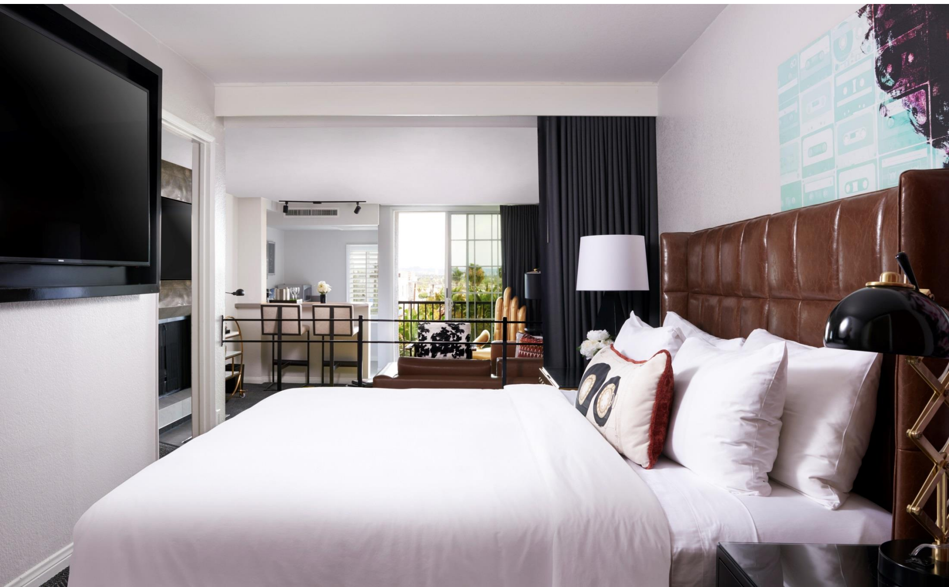
SUPERIOR KING SUITE