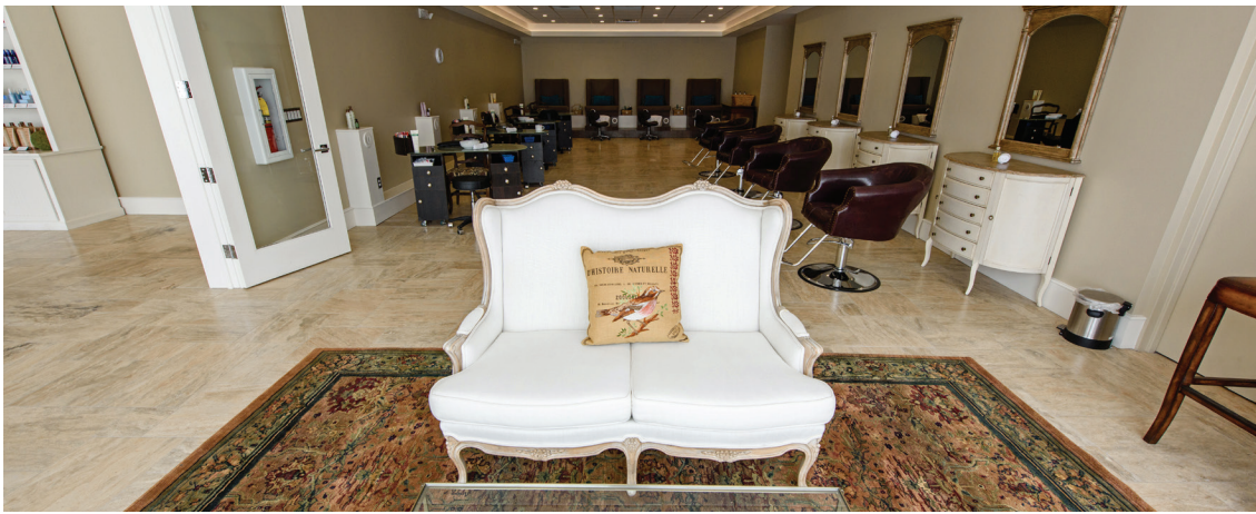
All services at lakeside spa and salon include an automatic 15% gratuity and 5% spa and sanitation fee. A 24 hour notice is required on all services otherwise there is a full charge for services.