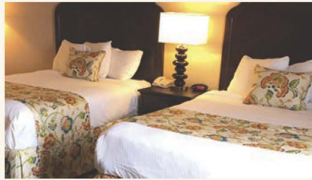
CLASSIC TWO QUEENS