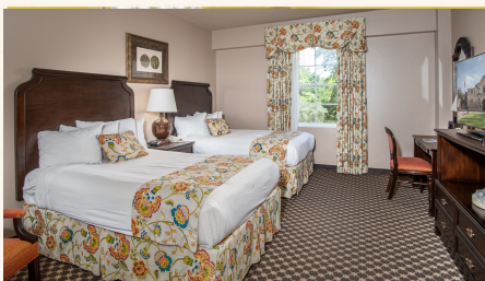
CLASSIC TWO DOUBLES