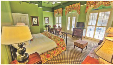
ALAMO PLAZA KING WITH BALCONY