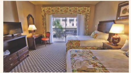
CLASSIC TWO DOUBLES WITH BALCONY