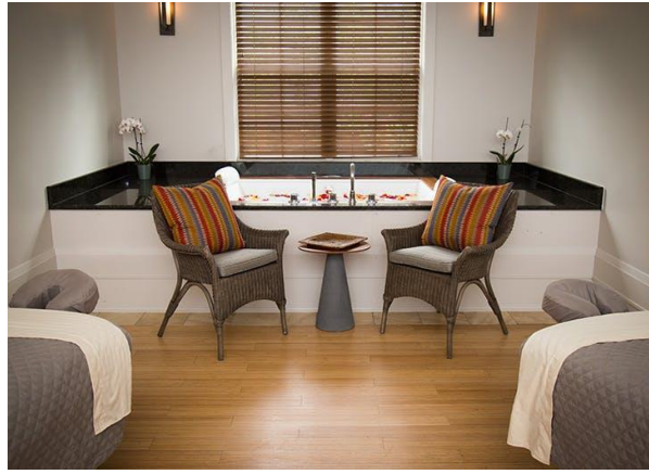
EMERSON RESORT & SPA