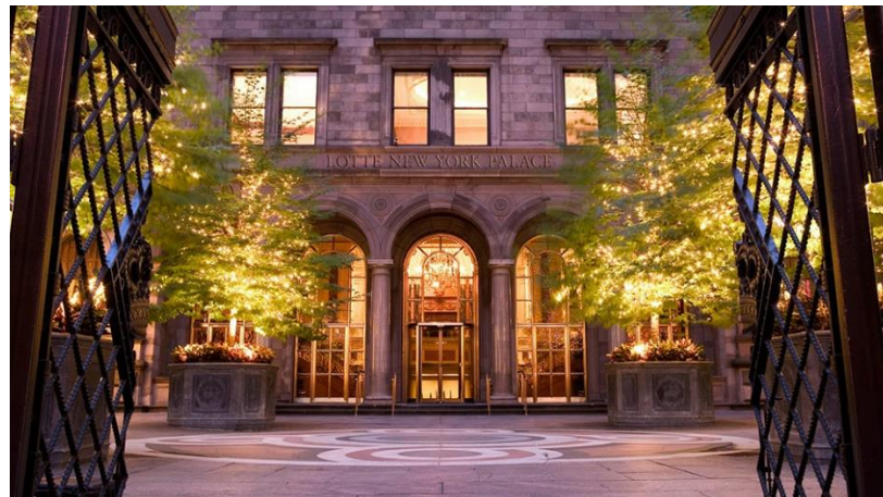
Lotte New York Palace.

Book a pre-show treatment at Encore's Five-Star spa to be relaxed and ready to laugh.