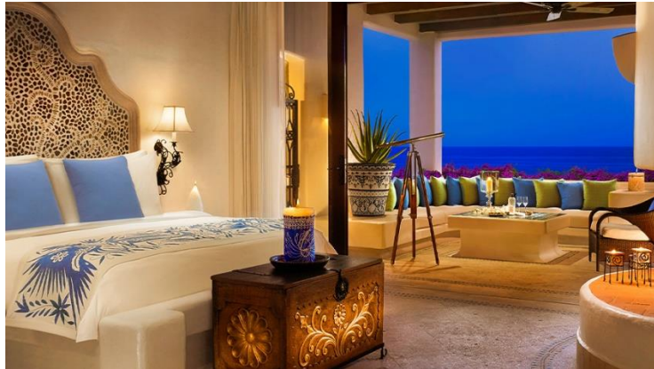
Las Ventanas al Paraíso, A Rosewood Resort.

Labor Day (September 2) represents the unofficial end of summer, the last chance to partake in a long, leisurely weekend before going back to school, work and commitments galore.