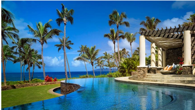
Montage Kapalua Bay. Credit: Montage Kapalua Bay