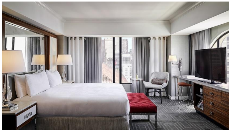
JW Marriott San Francisco Union Square.

And while the invitational is technically a week before Labor Day, opt to stay through the last week of summer to catch the U.S. Open players on their actual court of expertise at the USTA Billie King National Tennis Center roughly 10 miles away.