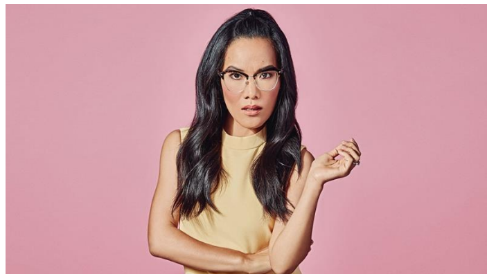
Ali Wong.

Make your Labor Day getaway at least a four-day affair at this lavish Five-Star San Jose Del Cabo retreat. Luckily, the resort touts a Suite Retreat promotion, which offers a complimentary fourth night stay, plus daily breakfast for two and roundtrip airport transfers to make your holiday escape even easier. And with perks like winding infinity pools overlooking the Sea of Cortez, open-air spa treatments, pool butlers and an alfresco tequila and ceviche bar, you might just want to double down on the package and stay for eight days instead.