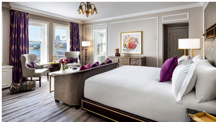
Fairmont Empress.

Montage's Discover Maui package jumpstarts your day's adventures with $150 daily resort credit to be used toward island activities and a $60 daily breakfast credit to help you fuel up at Four-Star Cane & Canoe .