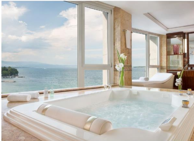
Royal Penthouse in Geneva.