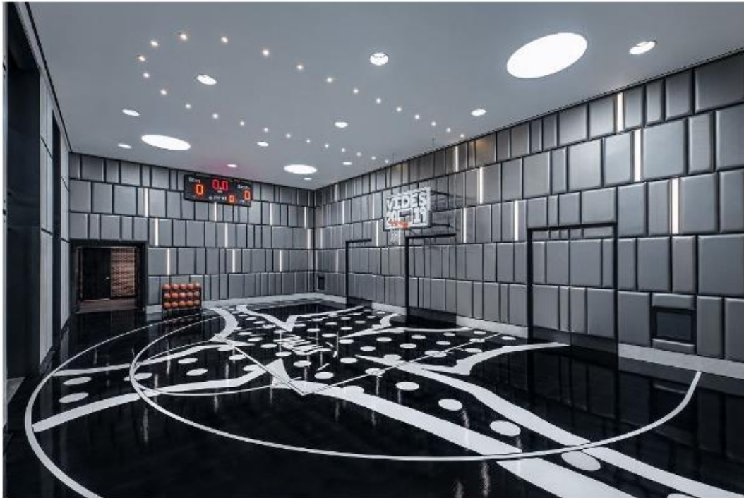
The basketball court at the Palms' Hardwood Suite.

There's opulence, and then there are suites that include unimaginable amenities. From a diamond ring to a full-size basketball court, there is no stone left unturned when it comes to the luxury of these five hotels.