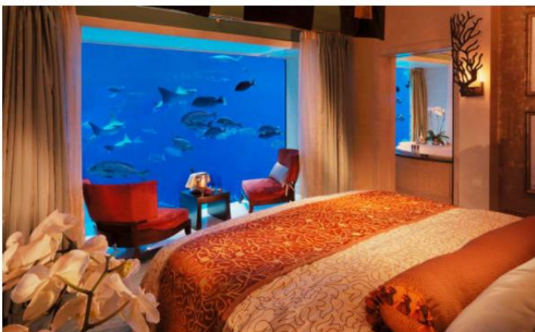
Atlantis' Underwater Suites.

This two-story, 10,000-square-foot suite is for those who are serious about their game. It boasts a 30-by-30-foot indoor basketball court for 10 people to live out their NBA fantasies. There is also a professional locker room, electronic scoreboard, and extra-long "NBA-sized" beds. (Rumor has it that LeBron James and Carmelo Anthony have both spent the night there.)