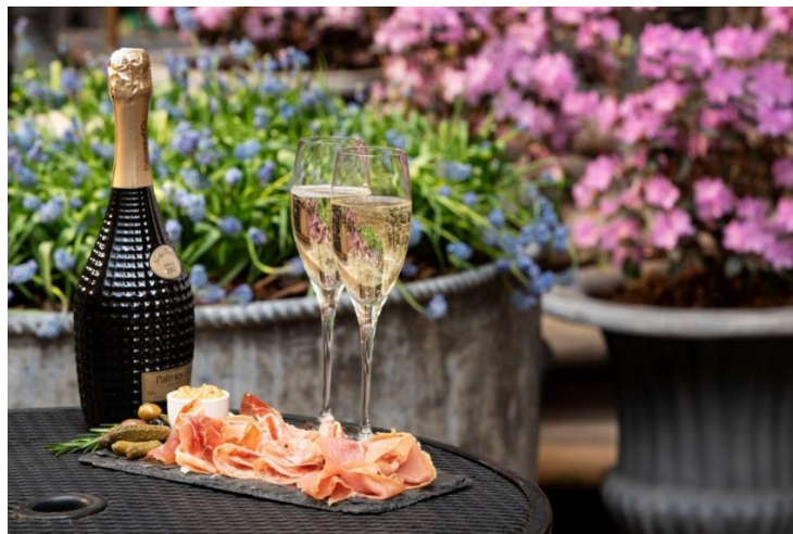
Lotte New York Palace: Rock & Rosé at The Palace