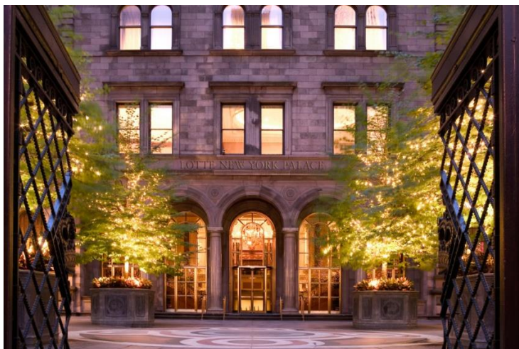
Lotte New York Palace

If you're looking to spruce up your (soon, but not so fast) end of summer, Lotte New York Palace is the perfect place to host that afterwork cocktail (it's ok if it actually starts at 4 PM), date night or impress some out of town friends. To future hotel guests – it's a great way to show your city knowledge to us locals that may not know of this gem quite yet.