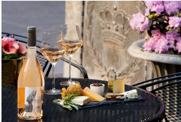
Lotte New York Palace: Rock & Rosé at The Palace