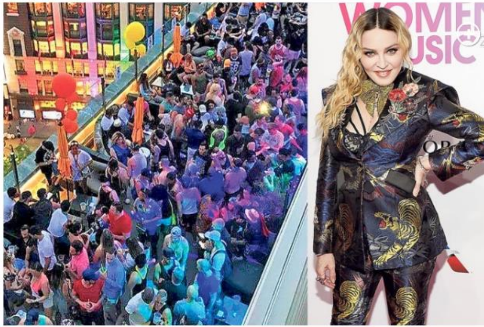
On June 29, Monarch Rooftop Bar & Indoor Lounge will host its epic annual Pride fête, while Madonna will perform at Pride Island on Pier 97.