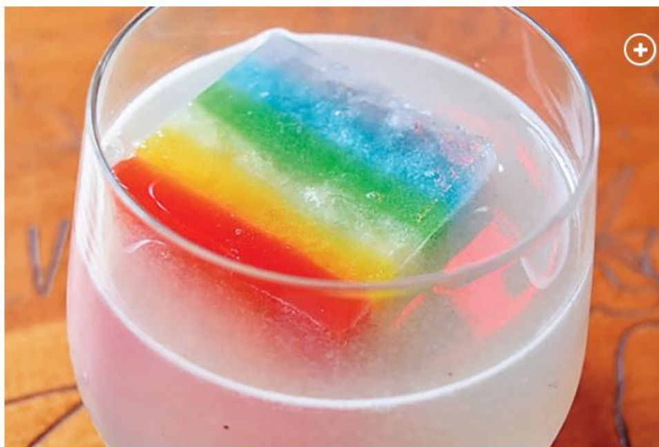
"Pride" margarita from Quality Eats.