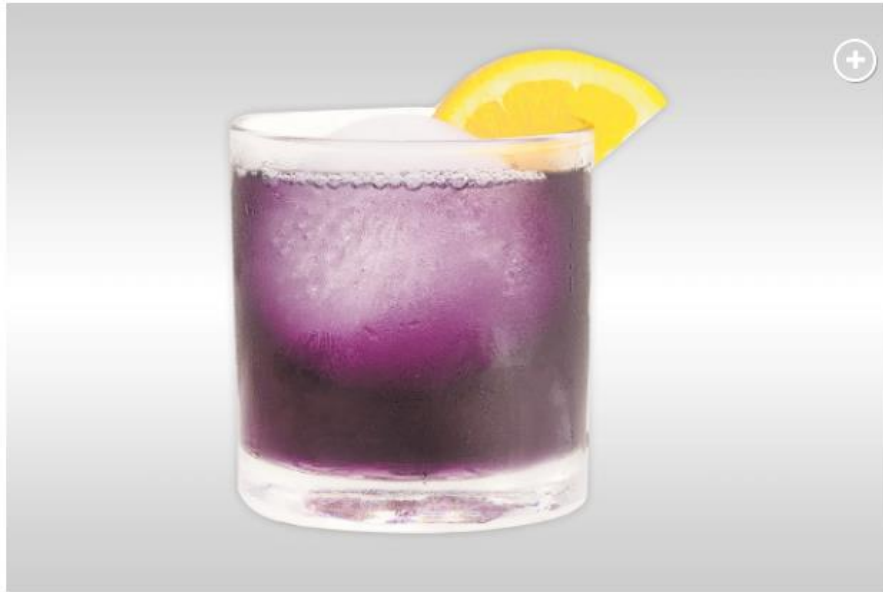
Waiting Game (benefiting the It Gets Better Project), $15 at Valerie , 45 W. 45th St.