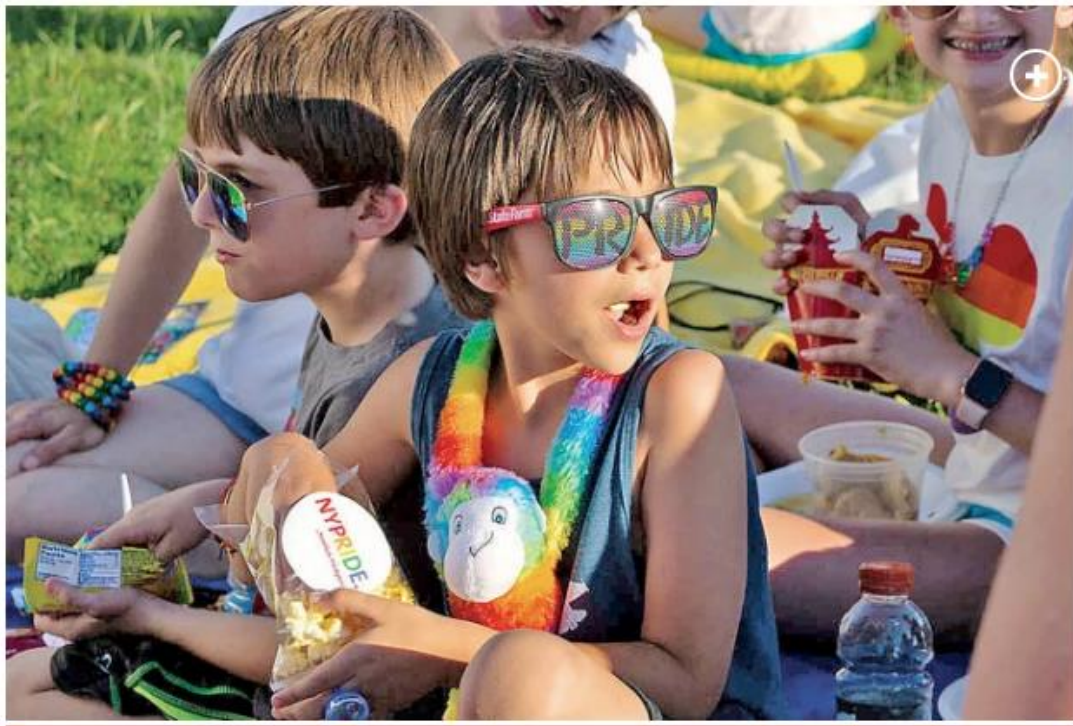
Family Movie Night on Pier 45 offers flicks and fun.