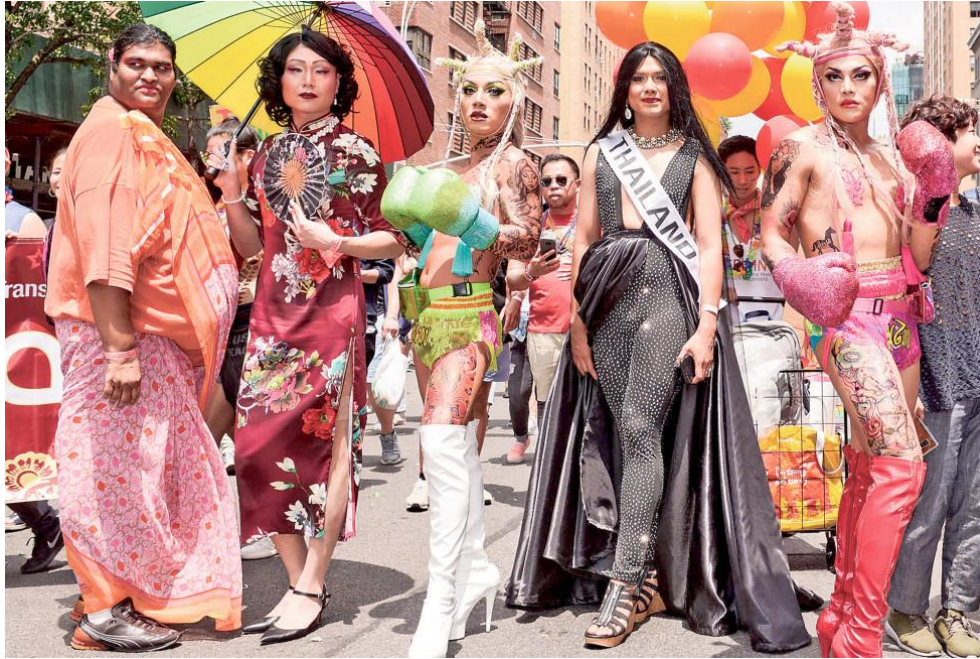
NYC's annual Pride March is expected to draw millions of visitors to the city this year.