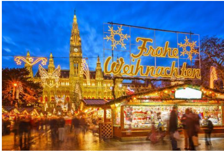
Montreal, Canada & Prague, Czech Republic