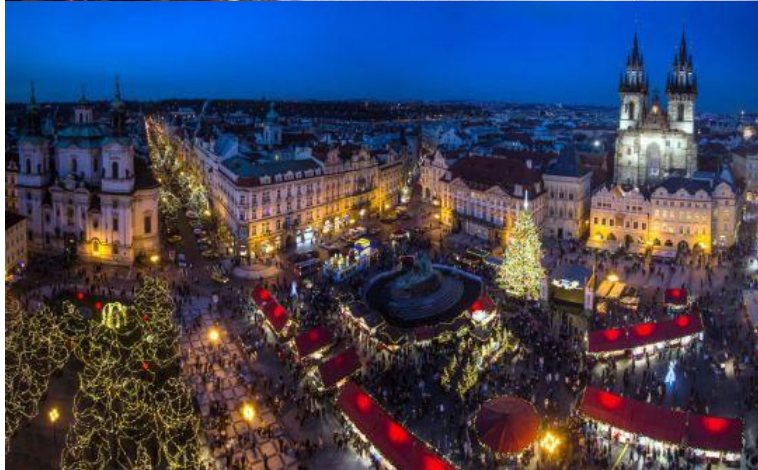
Florence, Italy & Krakow, Poland