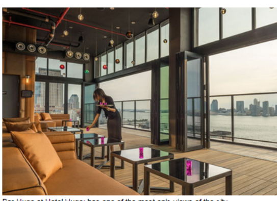
Bar Hugo at Hotel Hugo: has one of the most epic views of the city