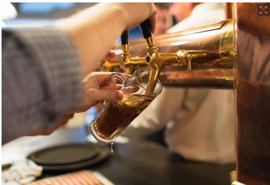
Fun's on tap at Paulaner NYC.

Belly up to Tuesday beer tastings on Sept. 23 and 30 featuring Oktoberfest brews from Hofstetten Original Hochzeitsbier von 1810, Schneider Edel Weiss, Hoffstetten and Erdinger. On Saturdays (Sept. 27 & Oct. 4), the festivities include live music as well as celebratory keg tapings and pig roasts; both are free until they run out. Test your strength in a mug-holding competition — whoever can hold a liter of beer with their arm extended straight out longest without spilling or bending their arm wins a glass boot full of beer. Now- Oct. 4. 113 N. Third St., at Berry St., Brooklyn. See radegasthall.com .