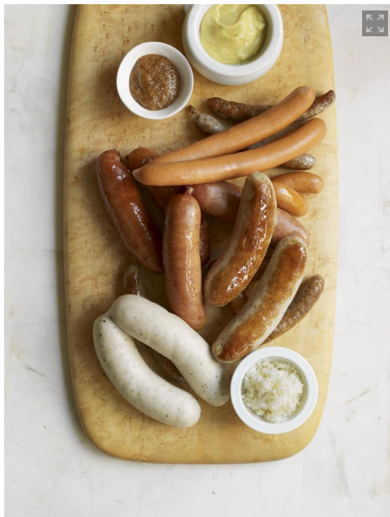
Sausage platter from Blaue Gans , a Tribeca restaurant offering Oktoberfest specials.