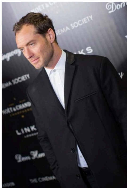
Jude Law

“I come from a little town in the south of Romania,” she said. “My mother always dreamed to be an actress, and then she always wished that for me. She wanted to see me on the big screen, and this just happened and it’s unbelievable.”