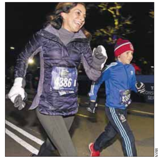
The NYRR Midnight Run returns to Central Park.