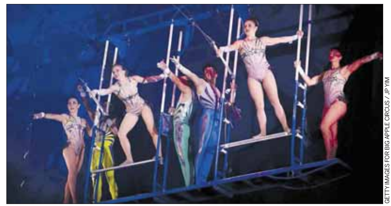
The Big Apple Circus is putting on a special performance this New Year's Eve.

rooftop bar is hosting "Sway in The Morning's' DJ Wonder for dancing all night long and an open bar from 9 to 10 p.m. general admission $50-$55, 9 p.m.-4 a.m.; 190 Allen St., tickets at eventcombo.com