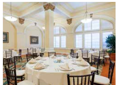
LEFT: The Music Hall offers Gulf views, natural light and high ceiling and is the hotel's legendary gathering space. TOP RIGHT: The hotel's Oleander Garden is a popular location for outdoor receptions and banquets. CENTER RIGHT: The Veranda offers an unobstructed view of the Gulf and a unique setting for events. BOTTOM RIGHT: The hotel has two parlors that can easily be converted for meals and meetings.