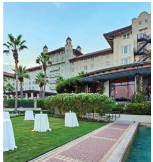
LEFT: Centennial Green features a charming pergola and overlooks the Gulf for ceremonies of up to 300 guests. TOP RIGHT: Hotel Galvez is a gorgeous backdrop for wedding photos. BOTTOM RIGHT: Oleander Garden is ideal for ceremonies and outdoor receptions and events.