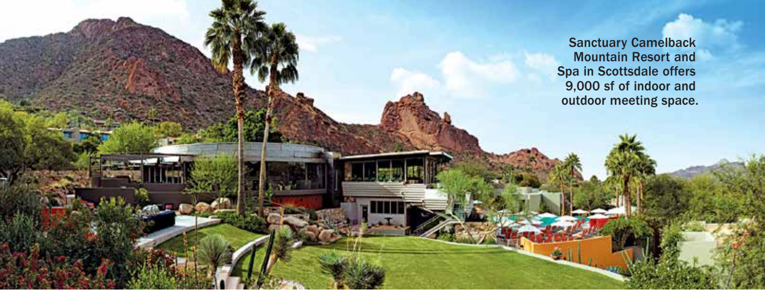
Sanctuary Camelback Mountain Resort and Spa in Scottsdale offers 9,000 sf of indoor and outdoor meeting space.

an exceptional attention to detail to ensure a productive, focused and well-orchestrated meeting.