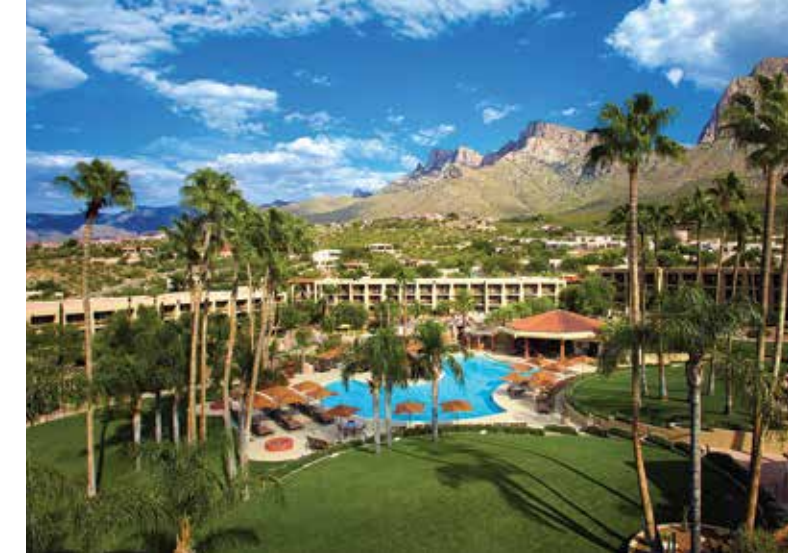
El Conquistador Tucson, a Hilton Resort, offers more than 100,000 sf of indoor and outdoor meeting space.

There's also the Last Territory Western venue — an on-site location that provides a taste of the Old West.