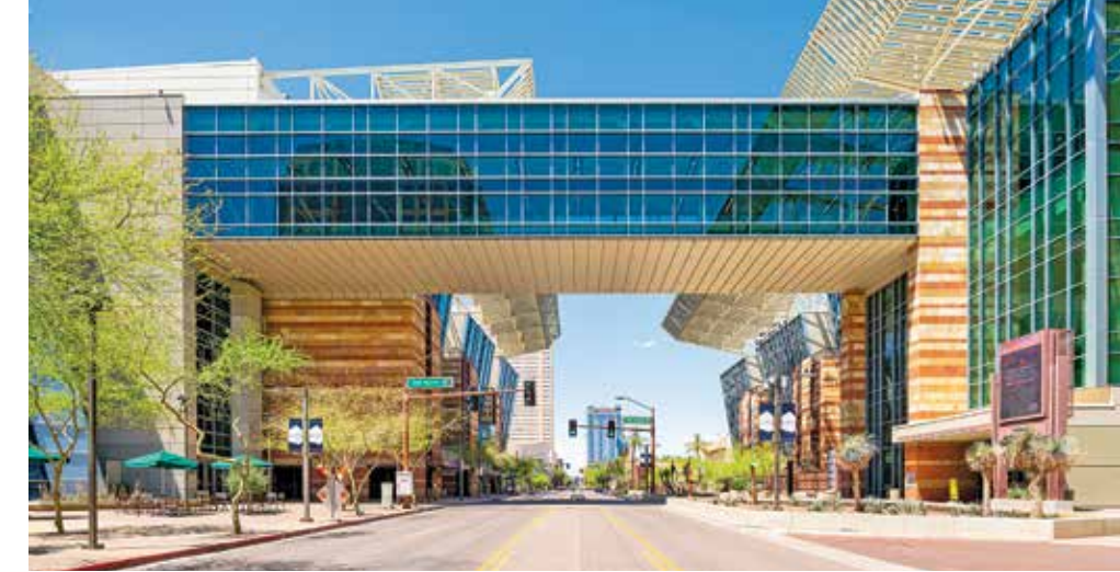
Phoenix Convention Center offers 900,000 sf of flexible meeting and event space, including a 312,500-sf main exhibit hall and a 46,000-sf ballroom.