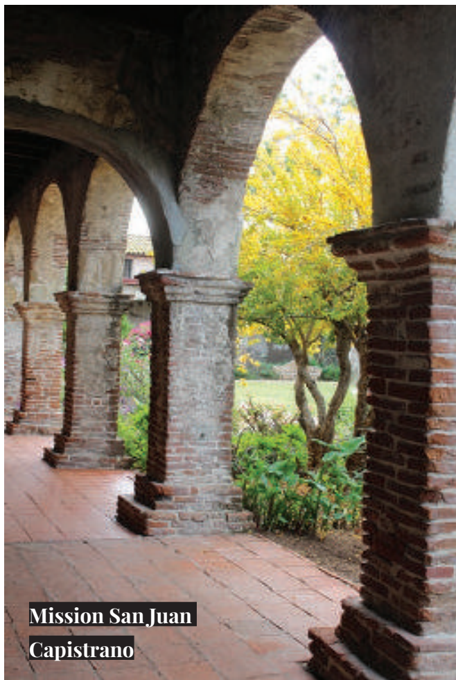
Mission San Juan Capistrano