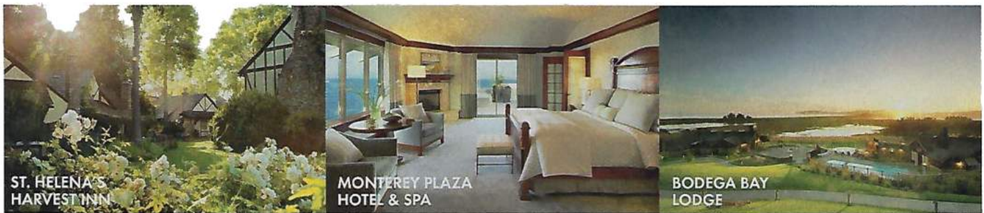
ST. HELENA'S HARVEST INN

Northern California shines this time of year, when warm days spent meandering its valleys and coastline easily slip into cool, rosé-hued evenings. There are few better ways to experience the dreamlike landscape than on backroads, where each turn promises a postcard-worthy moment. To herald November's special 120th anniversary issue, we partnered with Woodside Hotel Group ( woodsidehotelgroup.com ) to offer one contest winner and a guest a road trip in a Tesla Model S. The prize package, worth $2,600, includes the car rental and up to three nights at any of Woodside's 10 luxurious properties—including those pictured below. The route and destination are entirely up to you. Get the official rules at sunset.com/teslaroadtrip and enter to win on Instagram (September 18–October 16). —Kendra Poppy