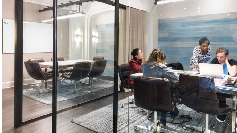
The lobby features glass-enclosed offices.

The lobby is bifurcated by elevators and stairs that lead to the front desk area, which also doubles as a grab-and-go cafe, where complimentary tea and coffee are served each morning. Next door, Ozumo, a Japanese restaurant, serves as a popular spot for the post-work crowd thanks to one of the city's largest sake lists. Bikes are offered gratis on a first-come, first-serve basis, and guests are welcome to work out at the historic YMCA next door for a small fee.