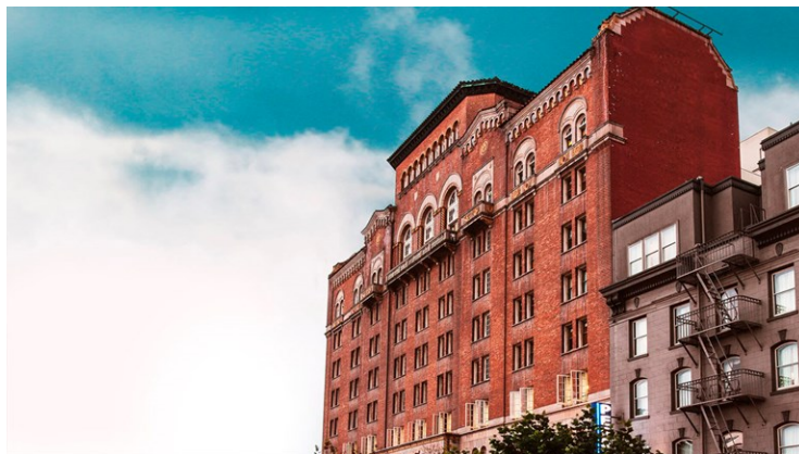
Built in the 1920s, Harbor Court Hotel San Francisco faces the Embarcadero.

I turned my back to the bridge and looked past the pier entrance and across the street. The summer fog had rolled in, obscuring the surrounding skyscrapers that make up the techy SoMa (or South of Market) neighborhood. But I could still clearly make out the Harbor Court Hotel San Francisco, an eight-story Spanish Colonial Revival building built in 1926.