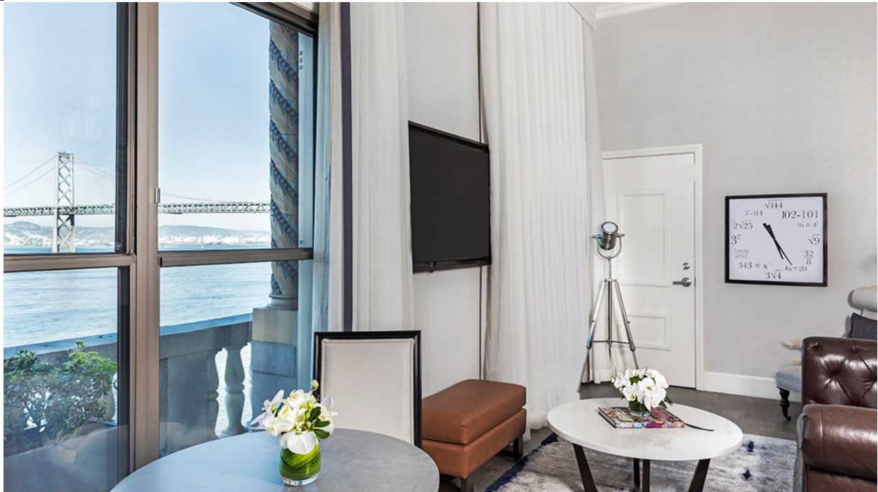
Harbor Court features techy design and an iconic location across from San Francisco's Bay Bridge.

At the Bay Bridge, cars and trucks were passing from Oakland into San Francisco at a steady pace. The seagulls, however, had lost their cool. Someone was flying a drone over the bridge, and the feathered aviators had become hysterical.