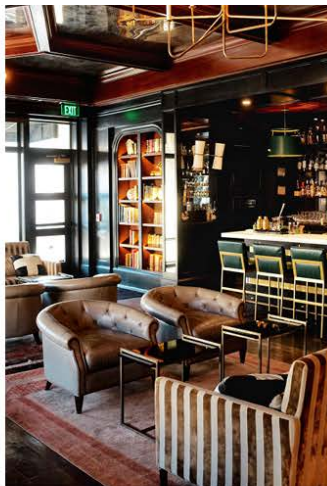
TOP: The Spectator Hotel. THREE BOTTOM RIGHT: French Quarter Inn.